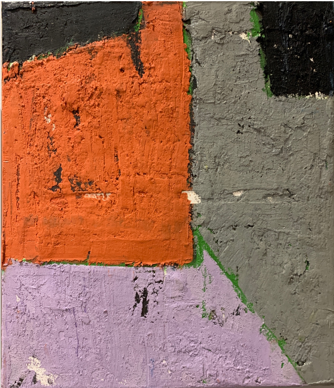
Untitled, 2005 Beeswax, oil and automotive paint on canvas 25 x 25 cm | 9.84 x 9.84 in