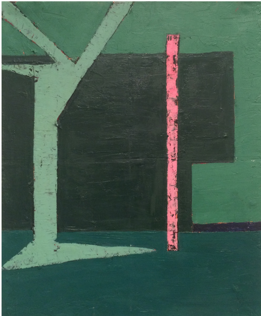
Untitled, Beeswax, oil and automotive paint on canvas 60 x 40 cm | 23.62 x 15.74 in