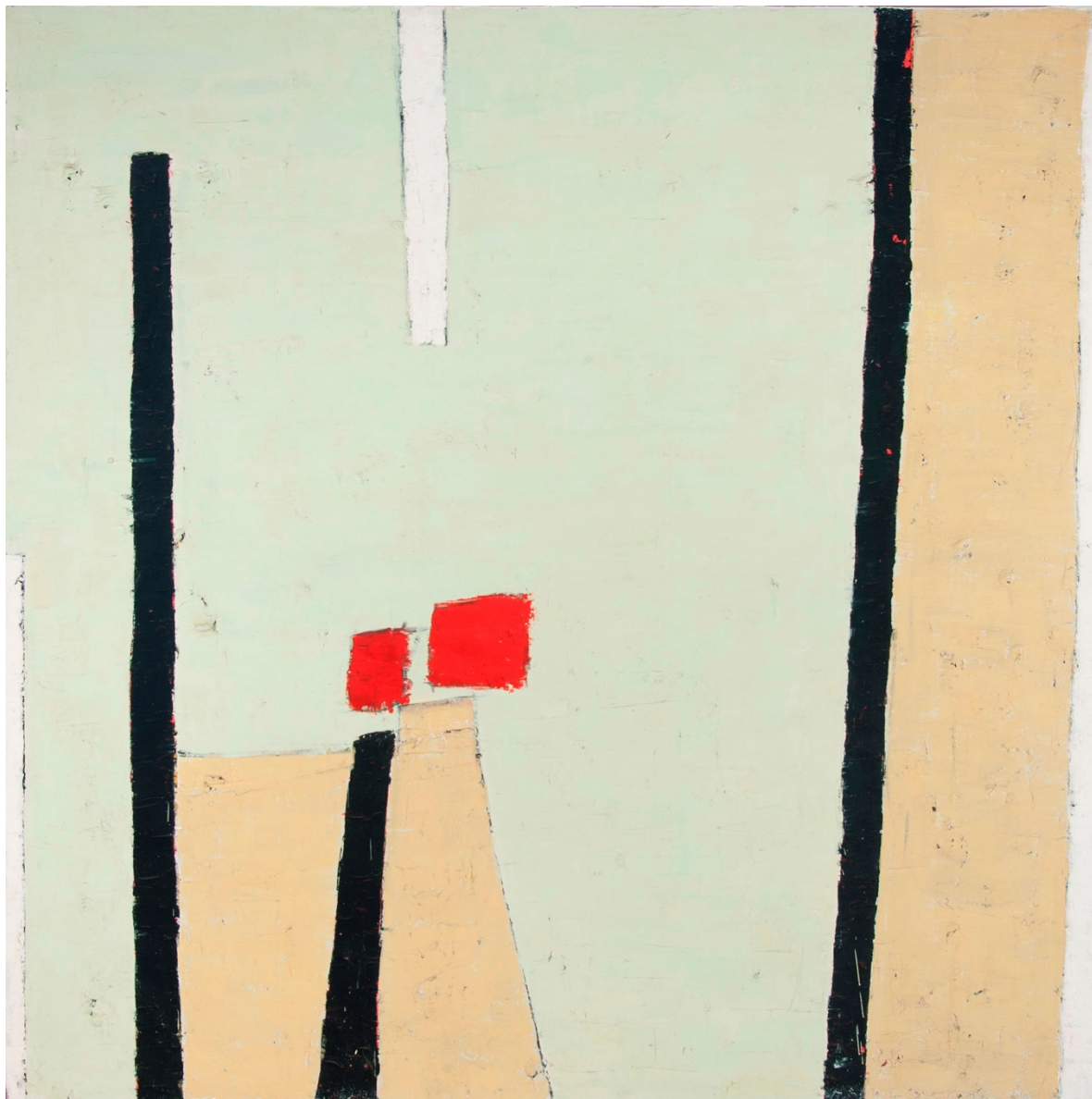
Untitled, 2008 Beeswax, oil and automotive paint on canvas 180 x 180 cm | 70.86 x 70.86 in