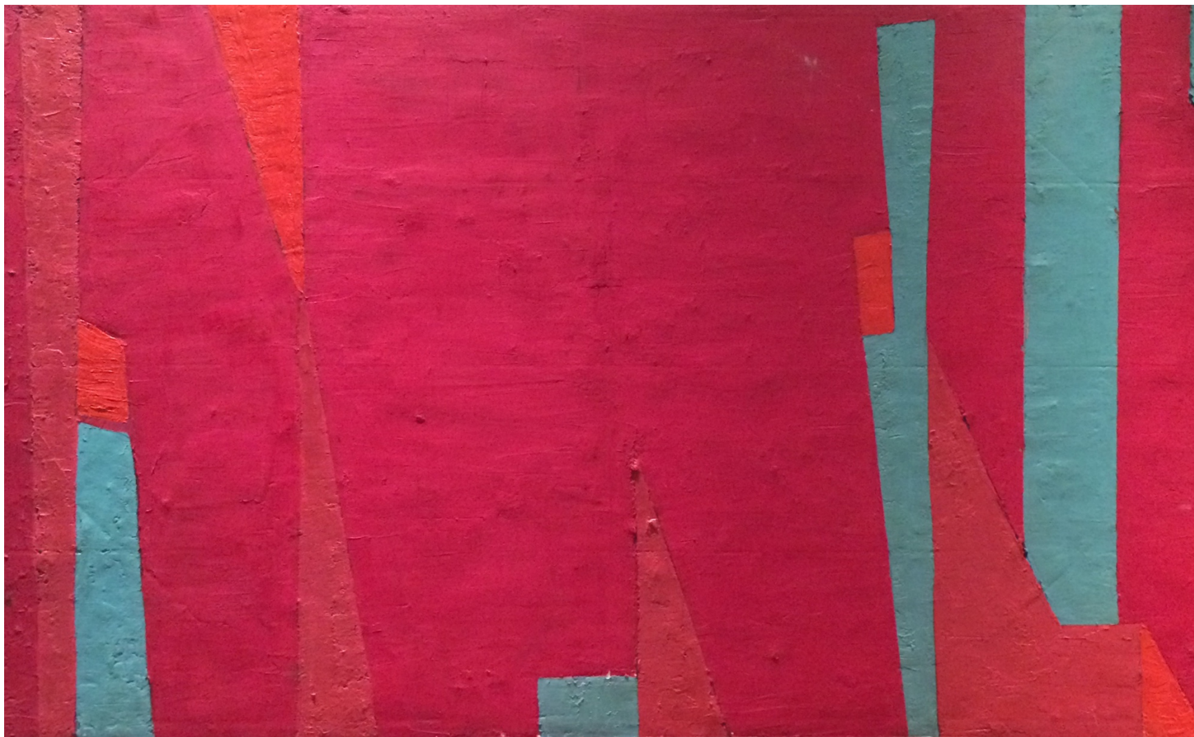
Untitled, 2007 Beeswax, oil and automotive paint on canvas 100 x 150 cm | 39.37 x 59.05 in