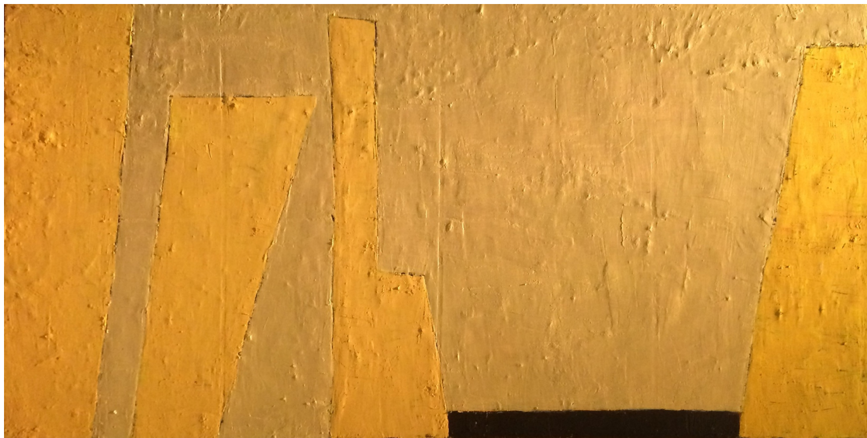
Untitled, Beeswax, oil and automotive paint on canvas 80 x 160 cm | 31.49 x 62.99 in