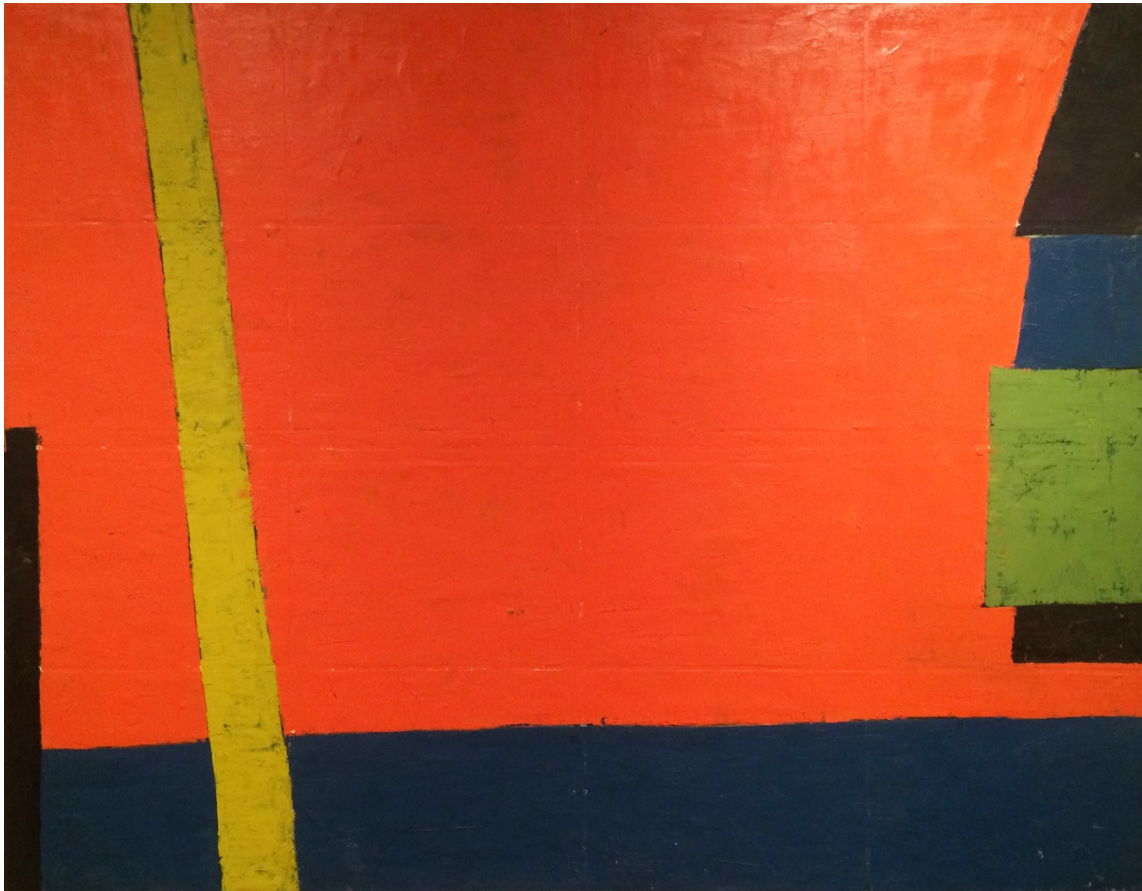
Untitled – series There is time for everything, 2009 Beeswax, oil and automotive paint on canvas