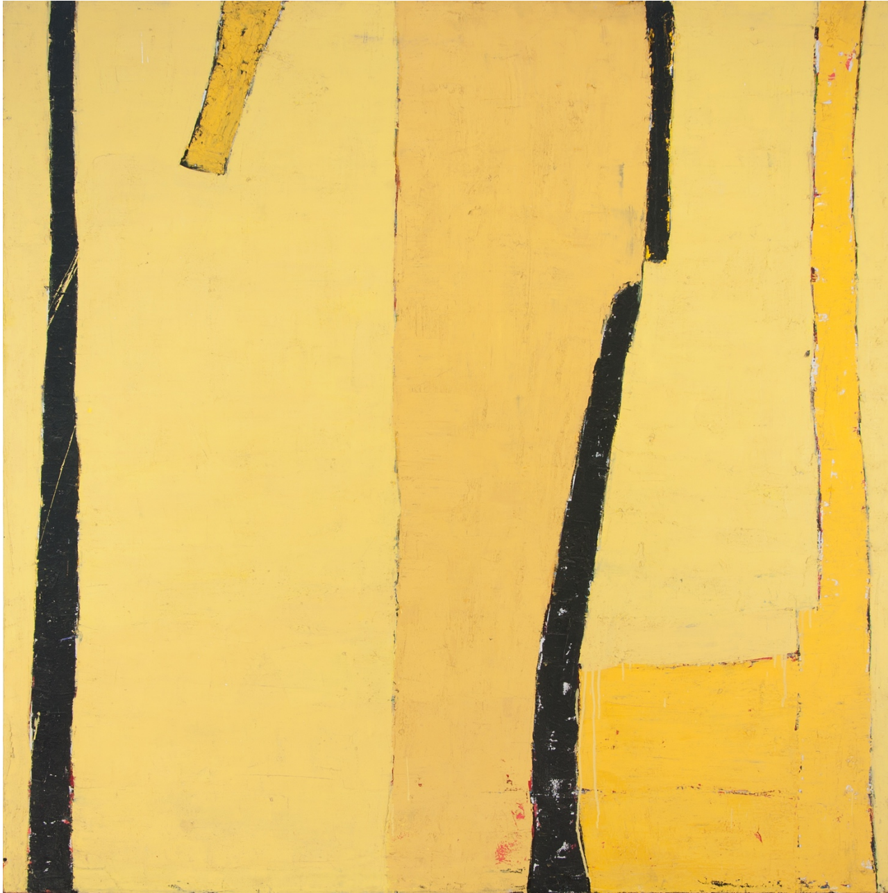
Untitled, 2004 Beeswax, oil and automotive paint on canvas 180 x 180 cm | 70.86 x 70.86 in