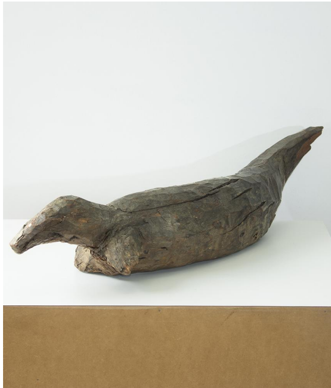
José Bezerra 1952, Buique - PE, Brasil

Untitled, Sem data | Undated Wooden sculpture 19 x 20 x 77 cm | 7.48 x 7.87 x 30.31 in