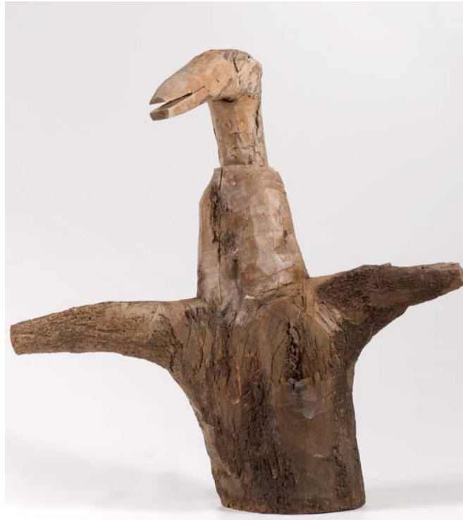
José Bezerra 1952, Buique - PE, Brasil

2008 Wooden sculpture 49 x 47 x 23 cm | 19.29 x 18.50 x 9.05 in