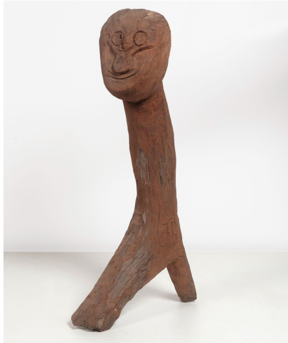
José Bezerra 1952, Buique - PE, Brasil

Untitled, 2011 Wooden sculpture 84 x 24 x 40 cm | 33.07 x 9.44 x 15.74 in