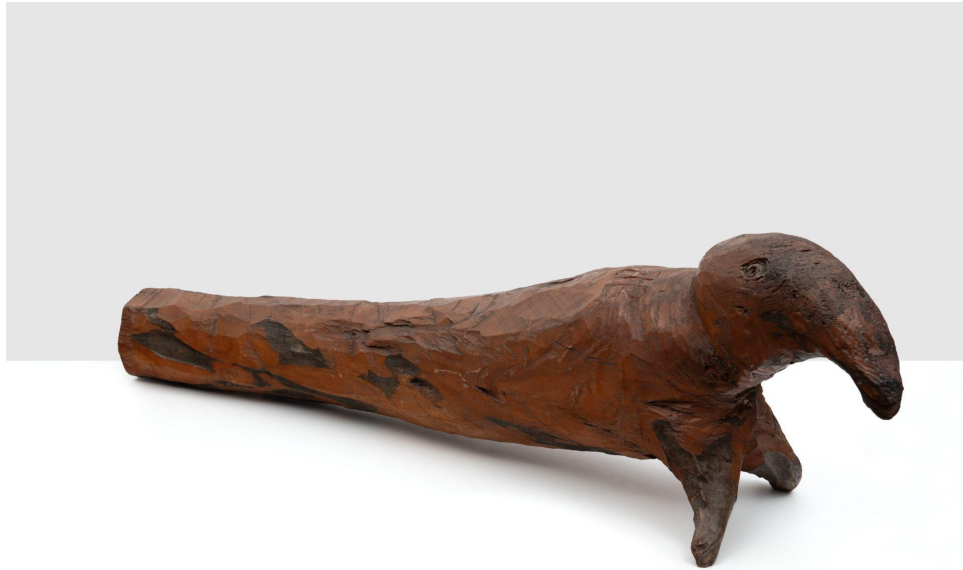
José Bezerra 1952, Buique - PE, Brasil

Untitled, 2008 Wooden sculpture 30 x 23 x 97 cm | 11.81 x 9.05 x 38.18 in