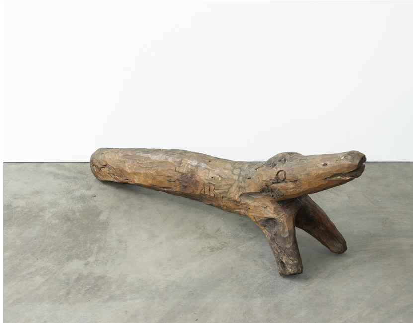
José Bezerra 1952, Buique - PE, Brasil

Untitled, Sem data | Undated Wooden sculpture 40 x 25 x 110 cm | 15.74 x 9.84 x 43.30 in