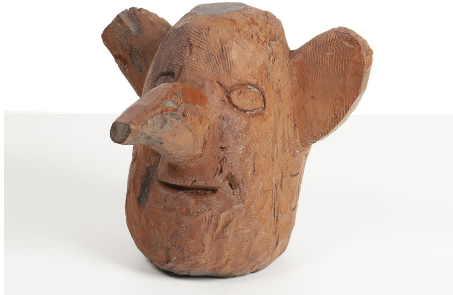
José Bezerra 1952, Buique - PE, Brasil

Untitled, 2011 Wooden sculpture 27 x 35 x 30 cm | 10.62 x 13.77 x 11.81 in