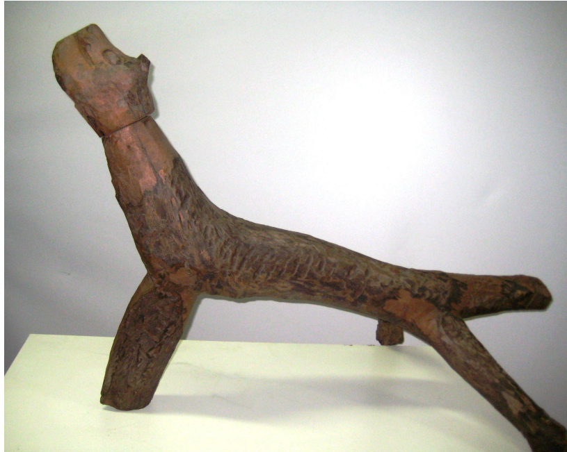
José Bezerra 1952, Buique - PE, Brasil

Untitled, 2011 Wooden sculpture 80 x 73 x 120 cm | 31.49 x 28.74 x 47.24 in