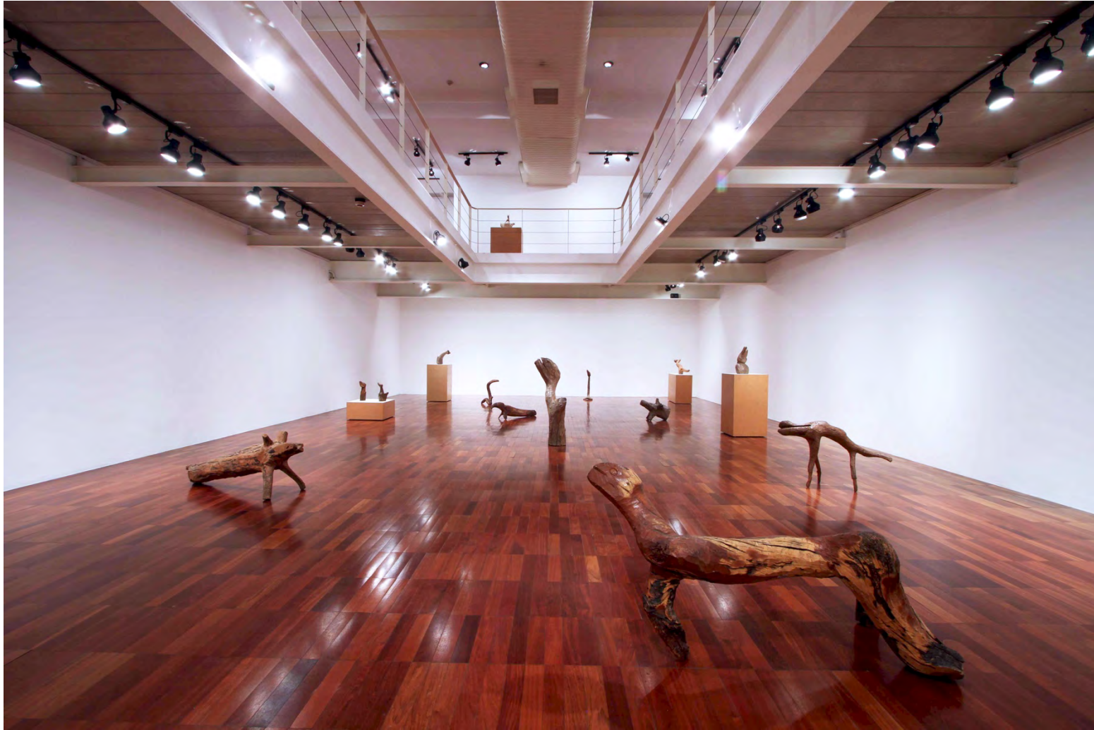
2015 José Bezerra | Sculptures, Galeria Estação, São Paulo, SP, Brazil