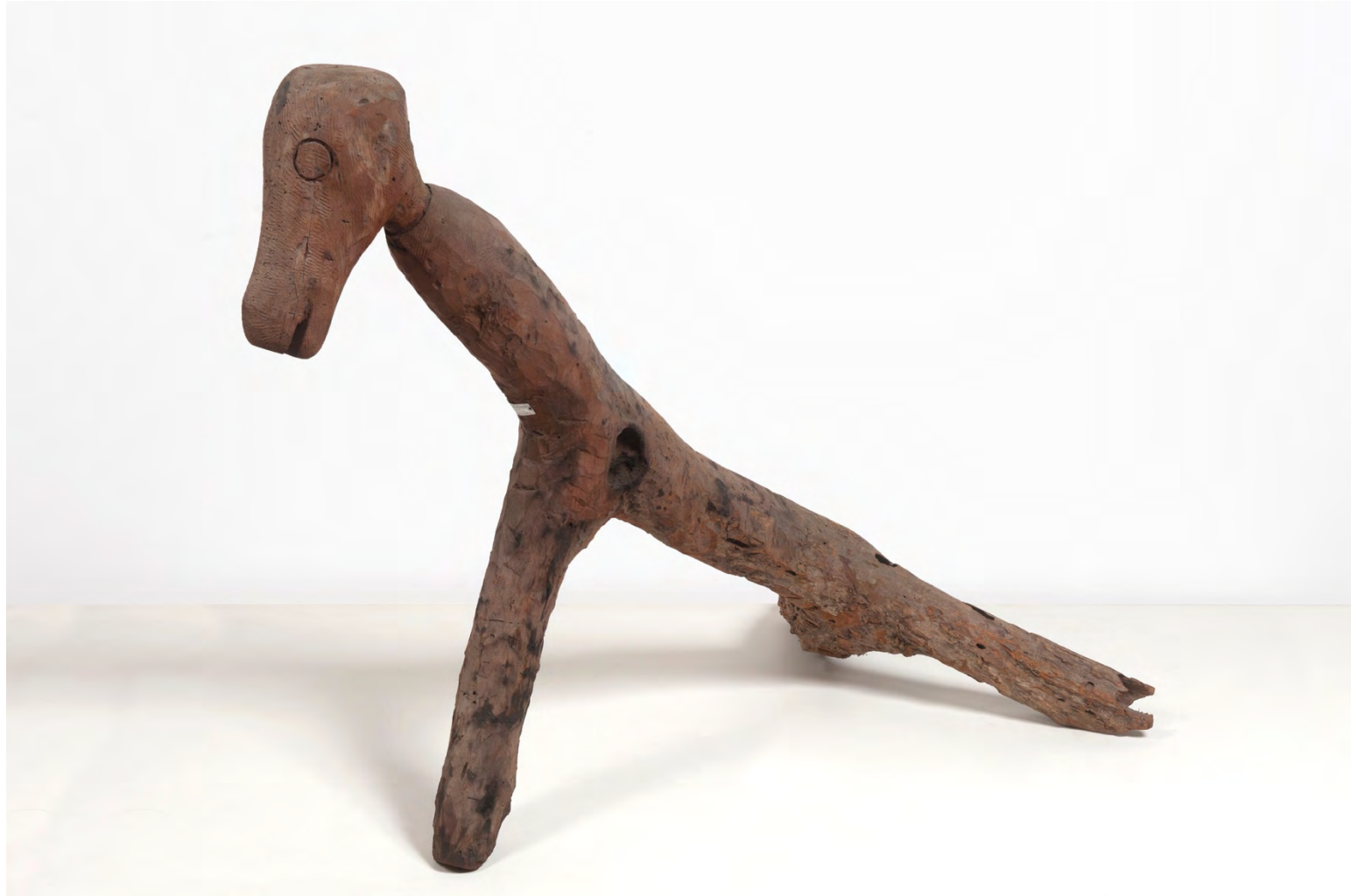
Untitled, 2013 Wooden sculpture 81 x 64 x 123 cm | 31.88 x 25.19 x 48.42 in