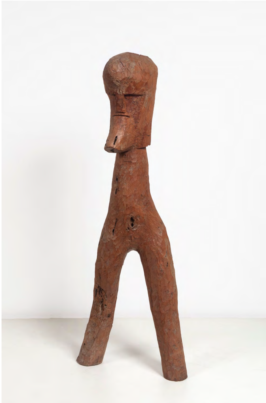
Untitled, 2011 Wooden sculpture 120 x 30 x 26 cm | 47.24 x 11.81 x 10.23 in