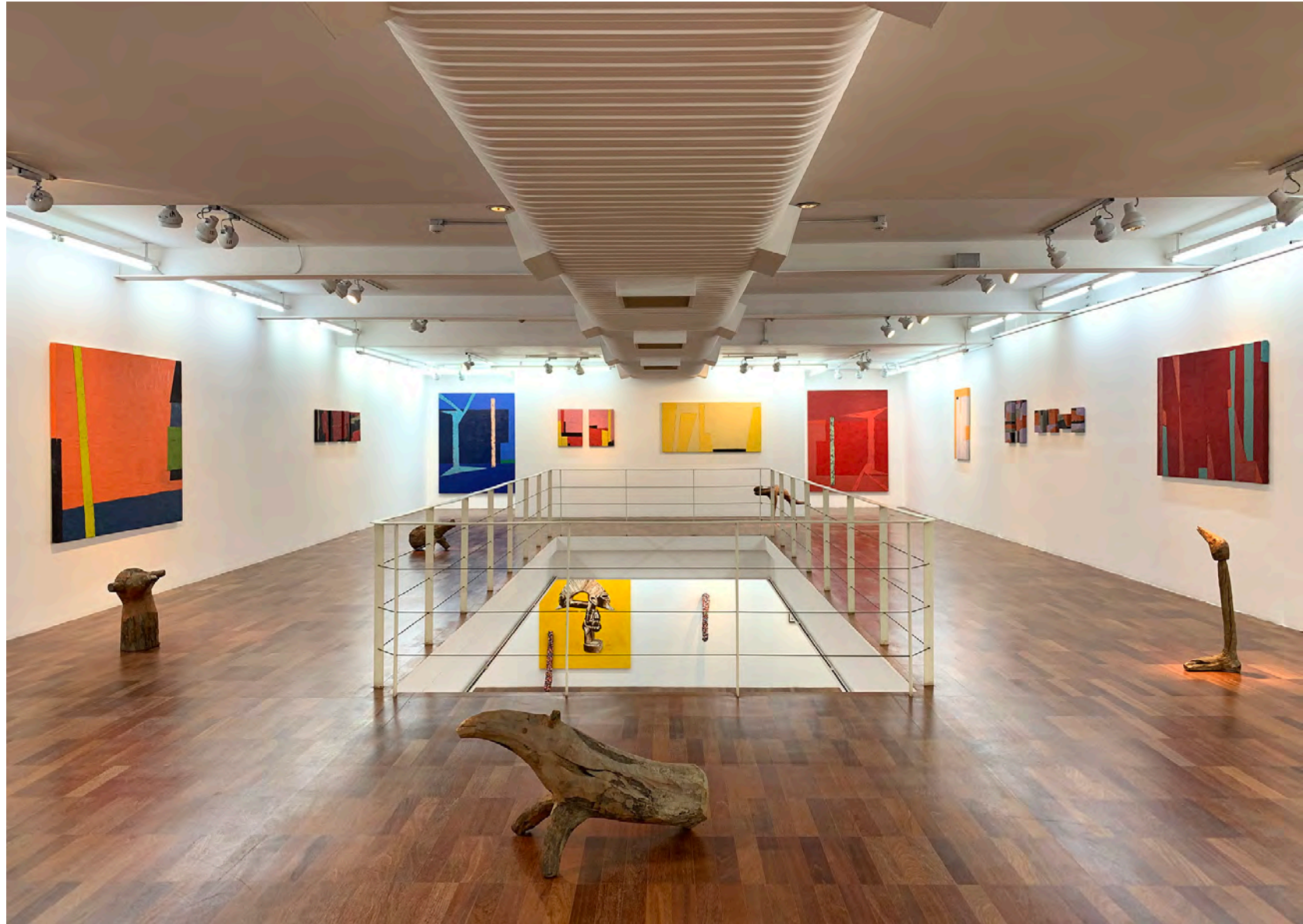
2021 Bailão de Dois: Dialogue between two artists, Galeria Estação, São Paulo, SP, Brazil