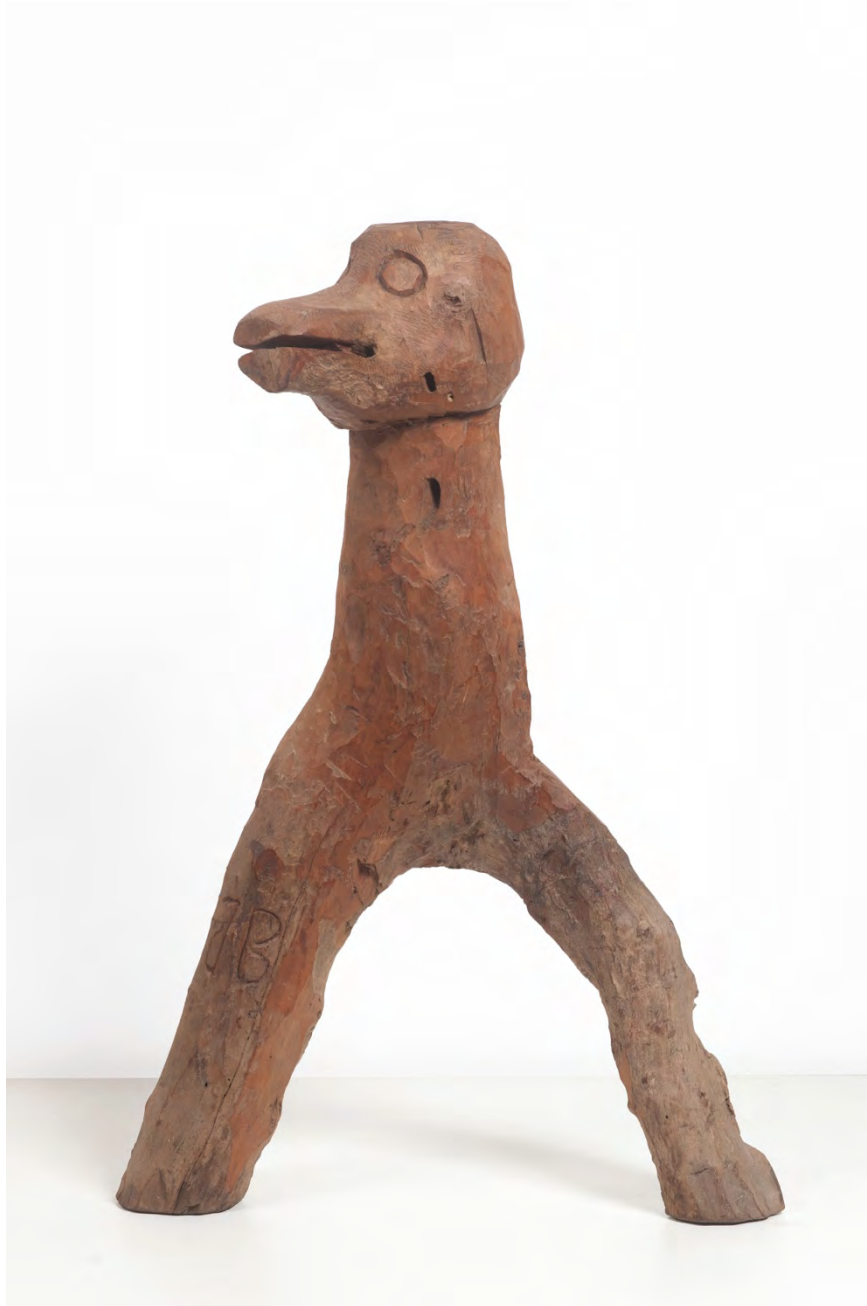
Untitled, 2013 Wooden sculpture 100 x 65 x 35 cm | 40.94 x 25.59 x 13.77 in