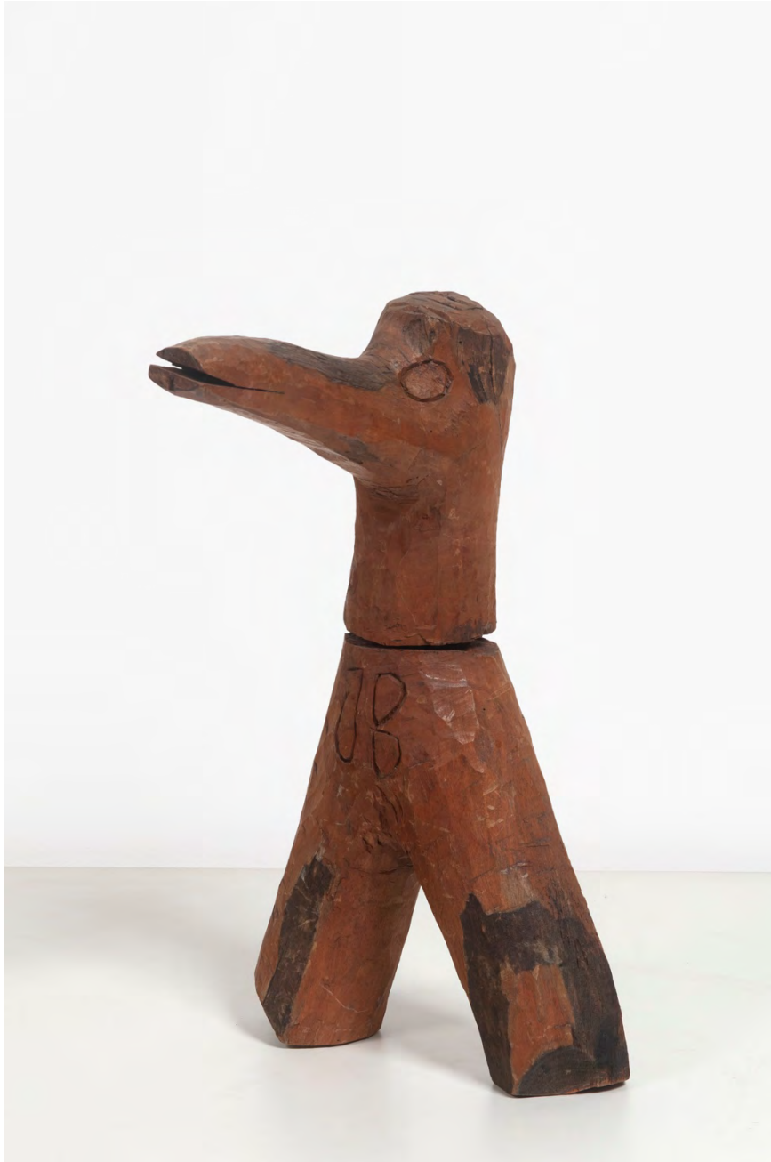
Untitled, Wooden sculpture 50 x 27 x 30 cm | 19.68 x 10.62 x 11.81 in