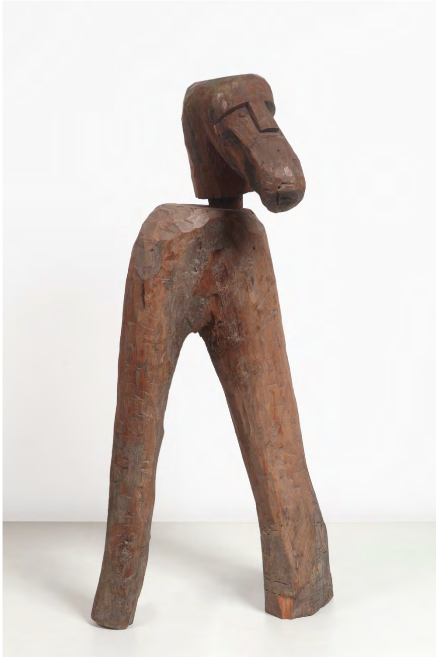
Untitled, 2008 Wooden sculpture 100 x 63 x 40 cm | 39.37 x 24.8 x 15.75 in