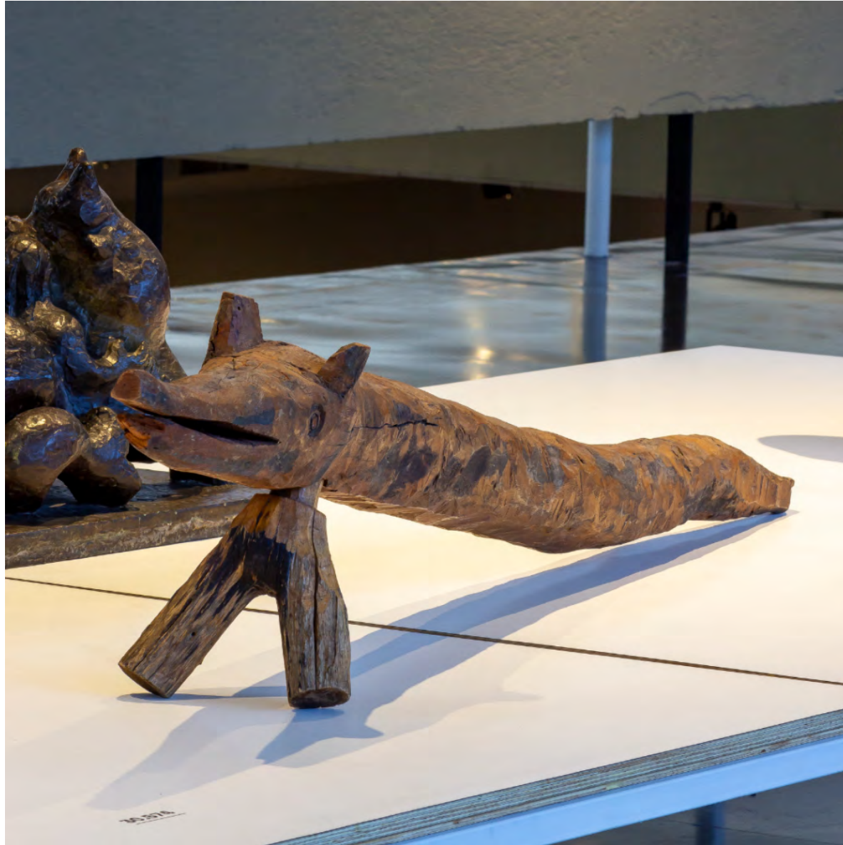
2021 Raw State, Museu de Arte Moderna do Rio de Janeiro, Rio de Janeiro, RJ, Brazil