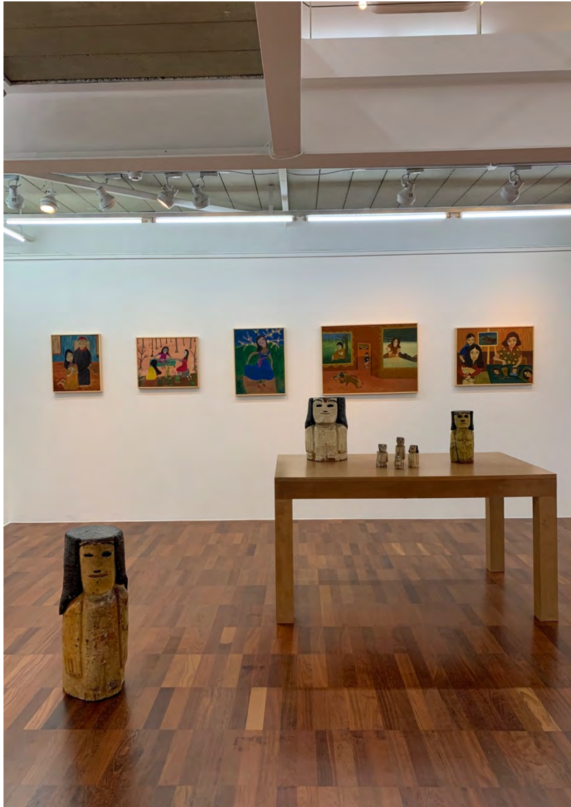
2020 Woman in Folk Art, Galeira Estação, São Paulo, SP, Brazil