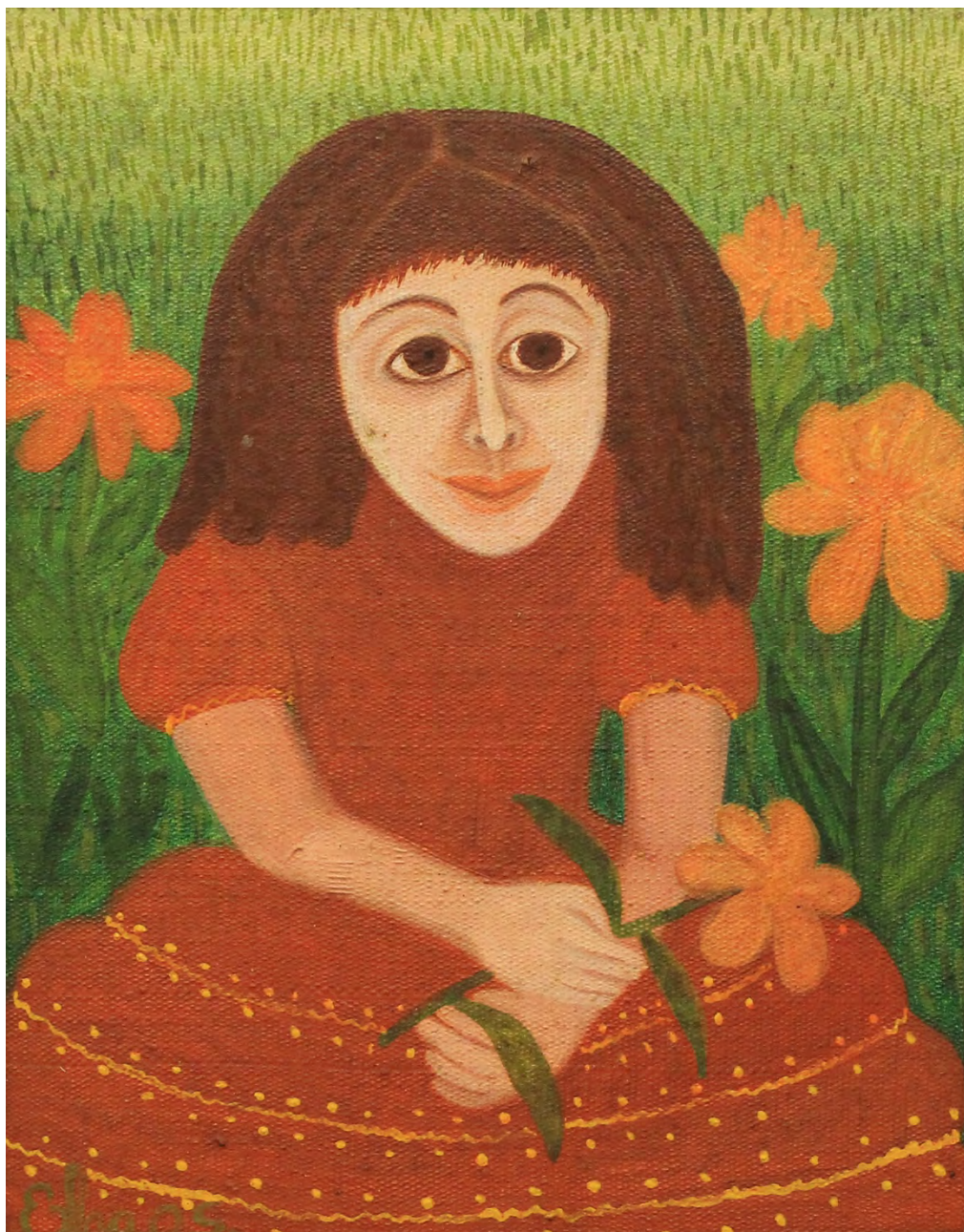
Untitled, Oil on canvas 24 x 19 cm | 9.45 x 7.48 in