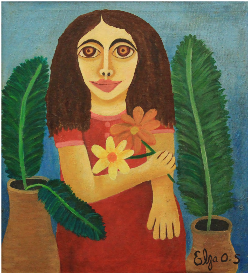
Girl with Flower, 70's Oil on canvas 34 x 31 cm | 13.39 x 12.20 in