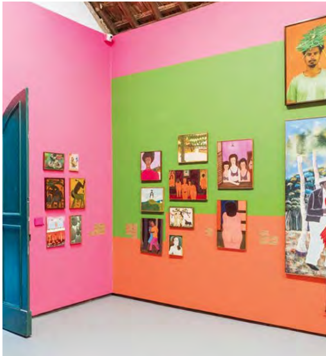
Folk Art – No Museum Less, Parque Lage, Rio de Janeiro, RJ, Brazil