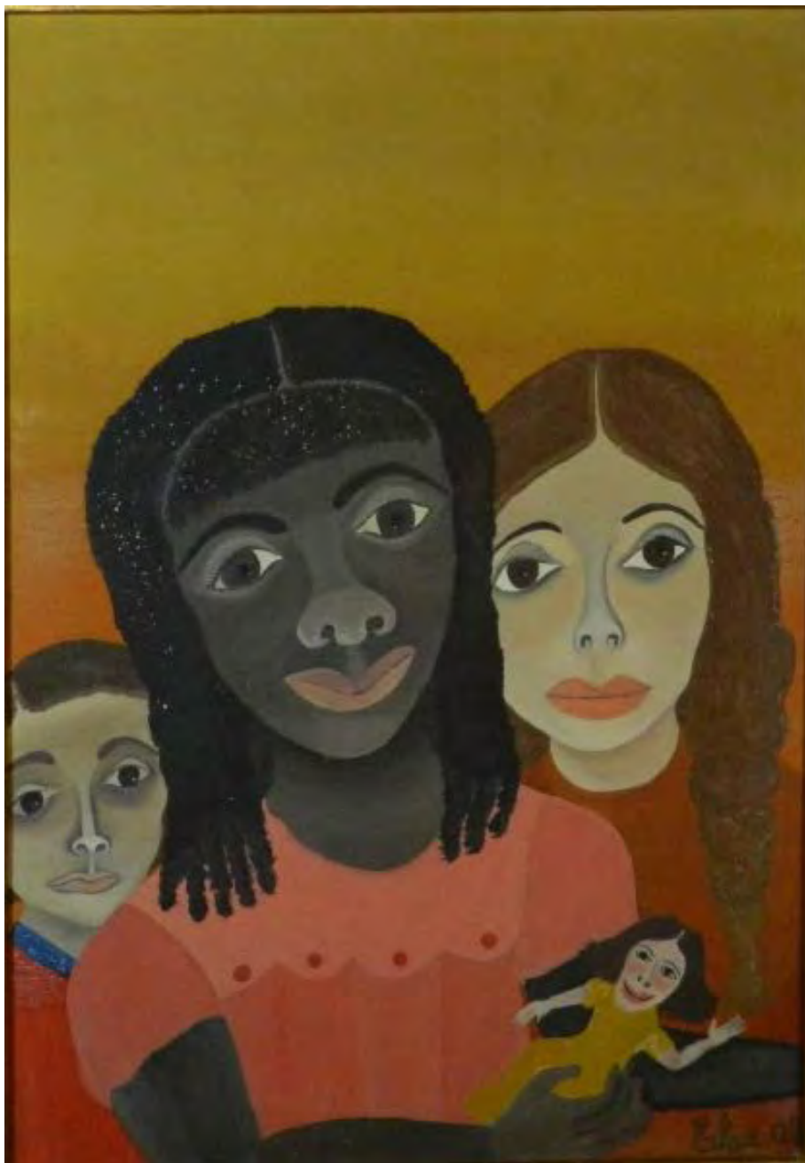
Untitled, Oil on canvas 65 x 46 cm | 25.6 x 18.11 in