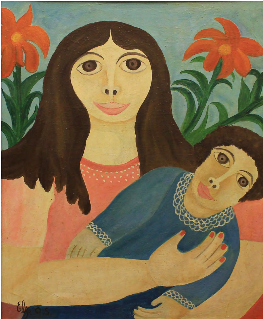
Maternity, Oil on Eucatex 61 x 50 cm | 24.02 x. 19.69 in