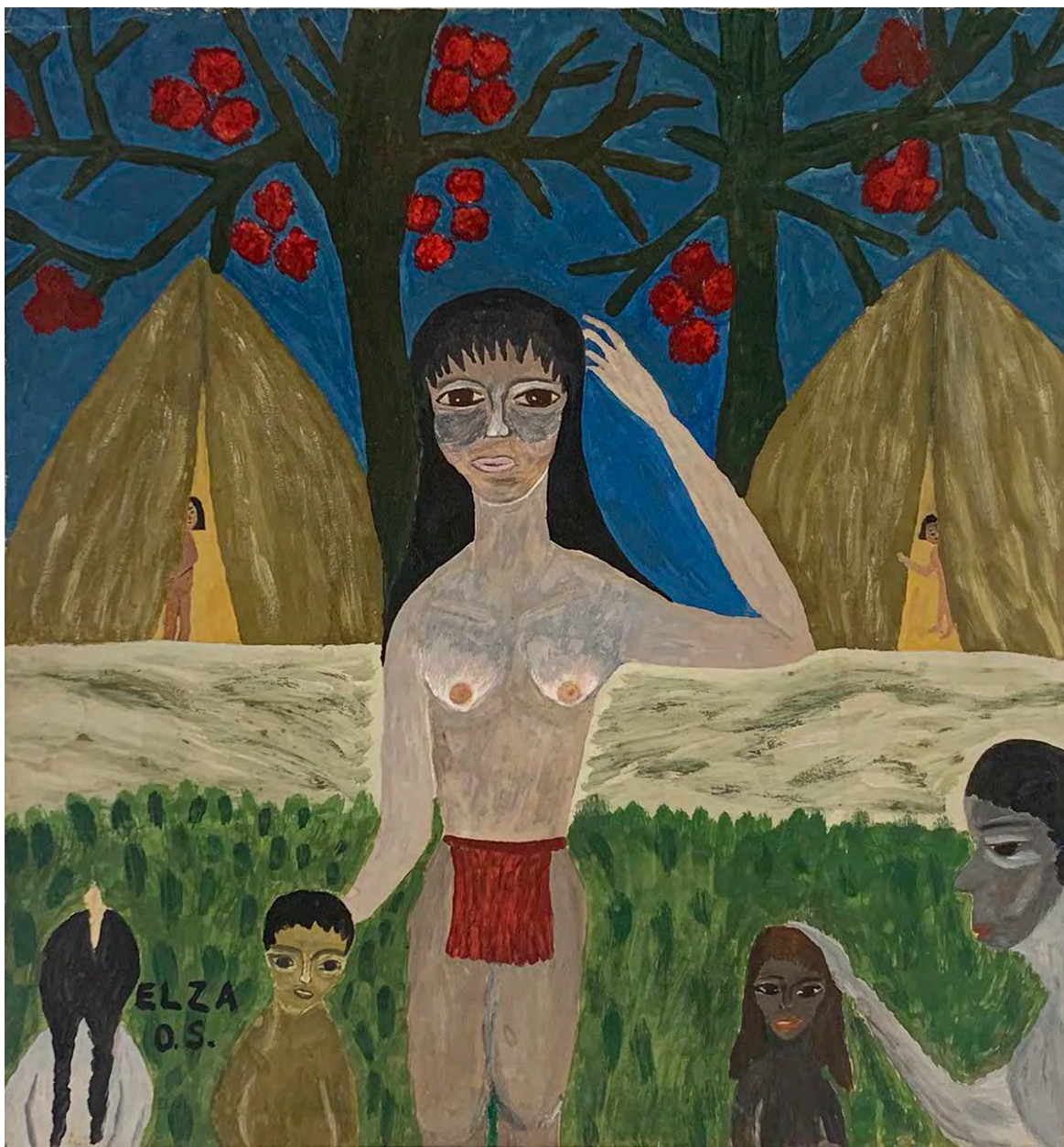
Untitled, Gouache on paper 35 x 33 cm | 13.77 x 12.99 in