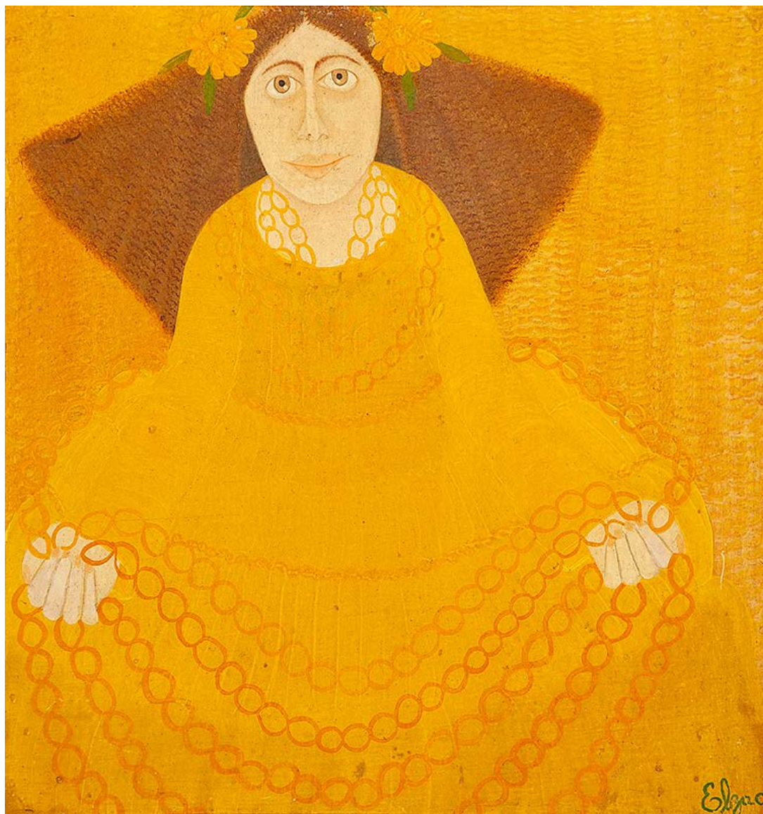
Untitled, Oil on eucatex 24 x 34,5 cm | 9.45 x 13.7 in