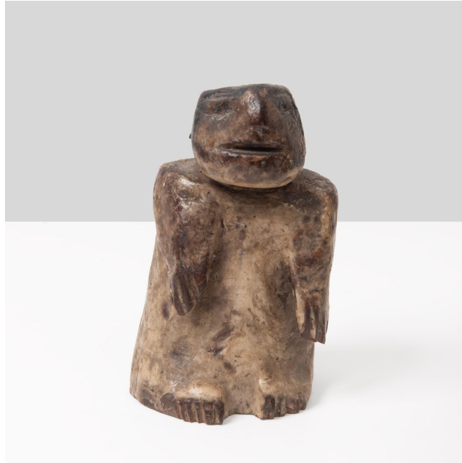
Conceição dos Bugres 1914, Povinho de Santiago - RS | 1984, Campo Grande - MS, Brasil

Untitled, Início dos anos 70 Wooden sculpture covered with beeswax 11 x 6.5 x 5.5 cm | 4.3 x 2.5 x 2.1 inches