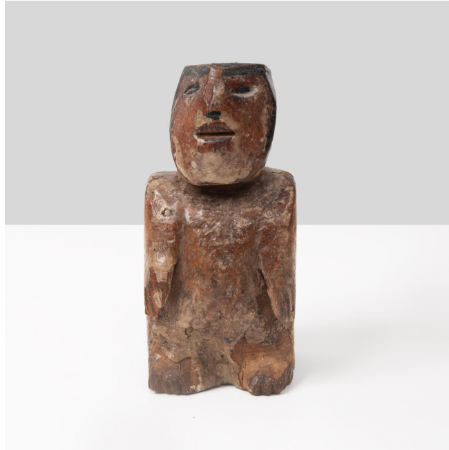
Conceição dos Bugres 1914, Povinho de Santiago - RS | 1984, Campo Grande - MS, Brasil

Untitled, Início dos anos 70 Wooden sculpture covered with beeswax 13 x 6 x 5.5 cm | 5.1 x 2.3 x 2.1 inches