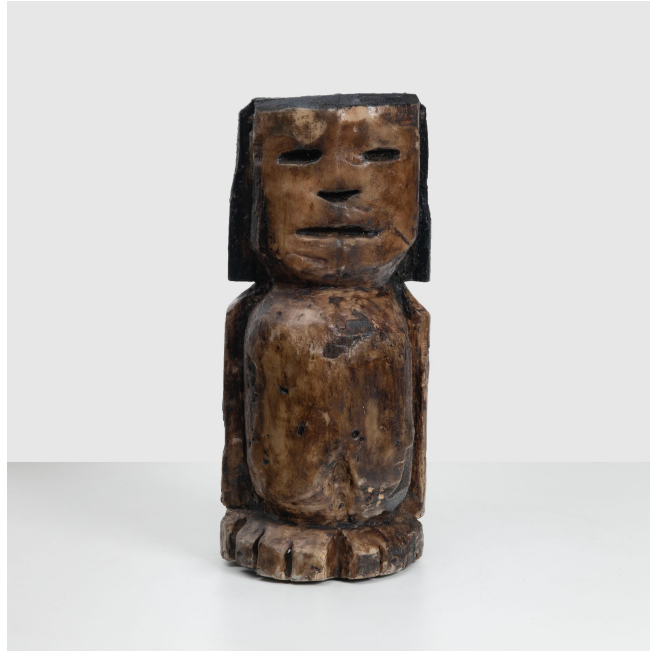
Conceição dos Bugres 1914, Povinho de Santiago - RS | 1984, Campo Grande - MS, Brasil

Untitled, Sem data | Undated Wooden sculpture covered with beeswax 30 x 15 x 15 cm | 11.81 x 5.90 x 5.90 in