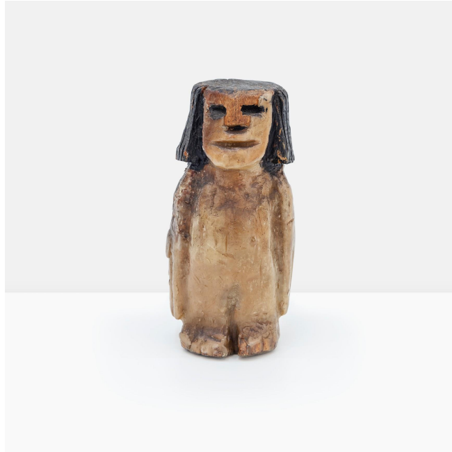
Conceição dos Bugres 1914, Povinho de Santiago - RS | 1984, Campo Grande - MS, Brasil

Untitled, Sem data | Undated Wooden sculpture covered with beeswax 16 x 09 x 09 cm | 6.29 x 3.54 x 3.54 in