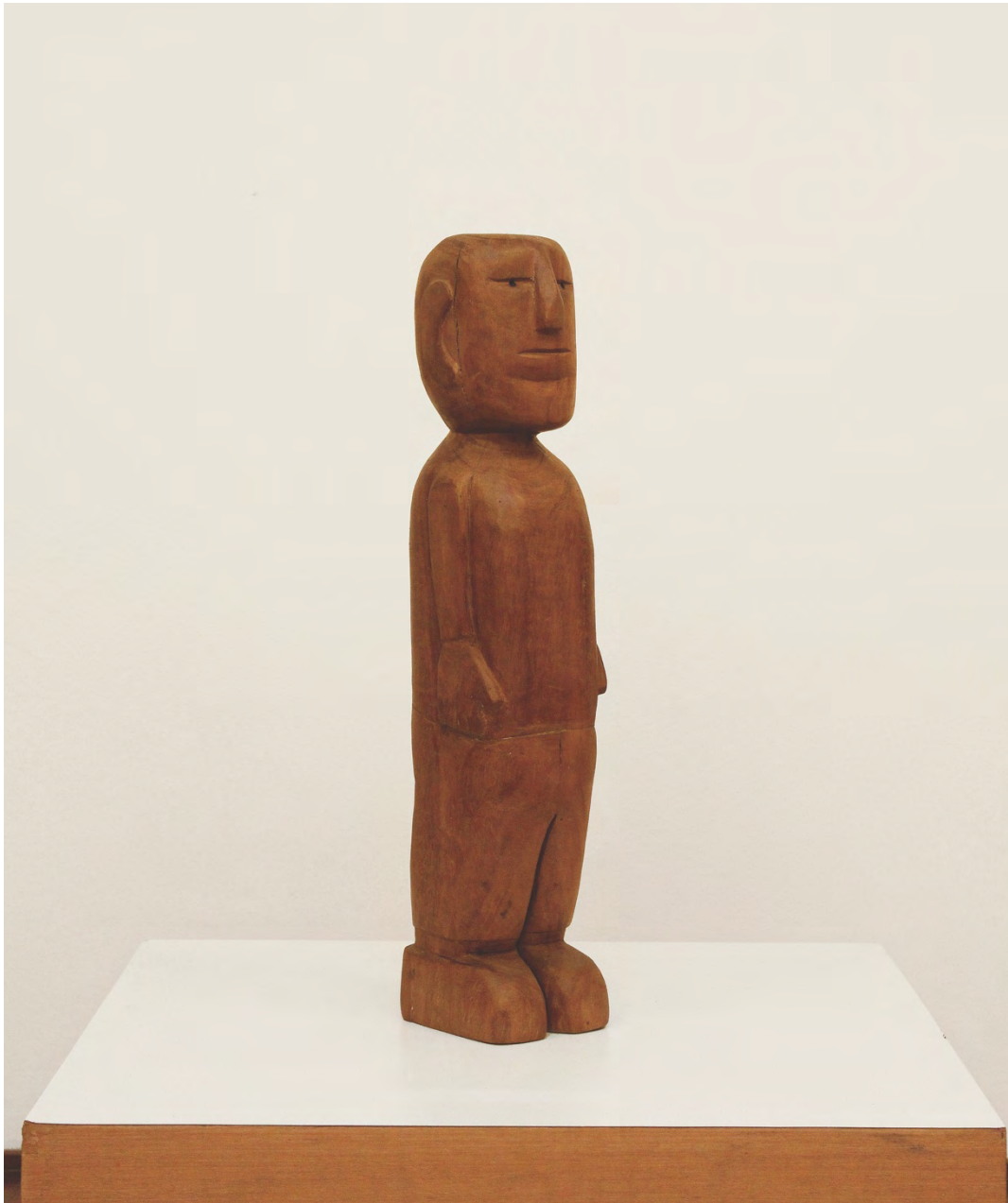
Untitled, 2008 Wooden sculpture 60 x 13 x 14 cm | 23.62 x 5.11 x 5.51 in