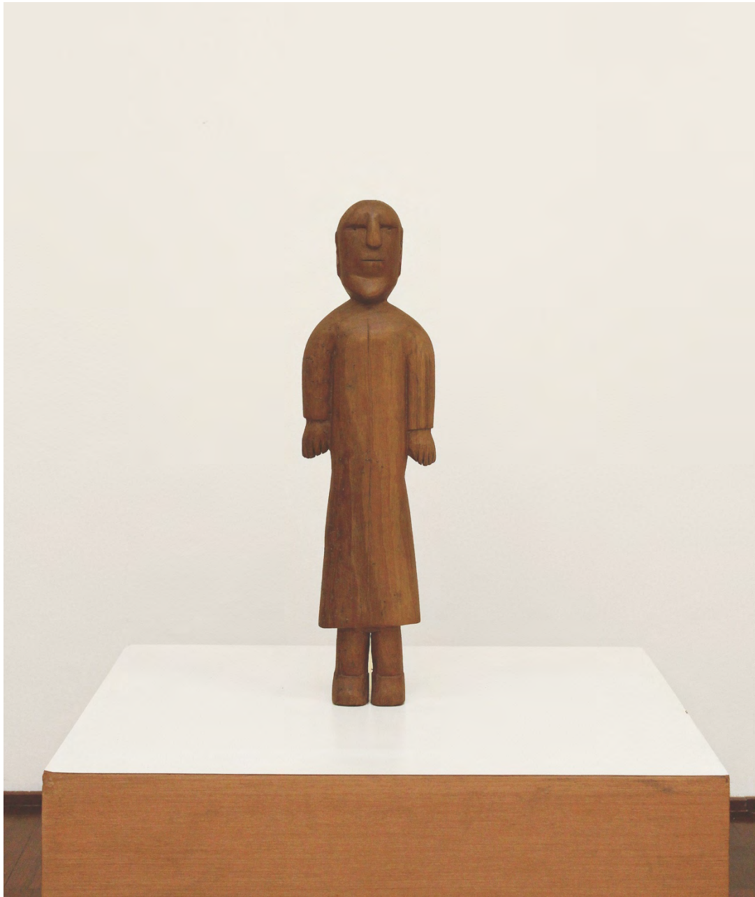
Untitled, 2008 Wooden sculpture 55 x 16 x 7 cm | 21.65 x 6.29 x 2.75 in