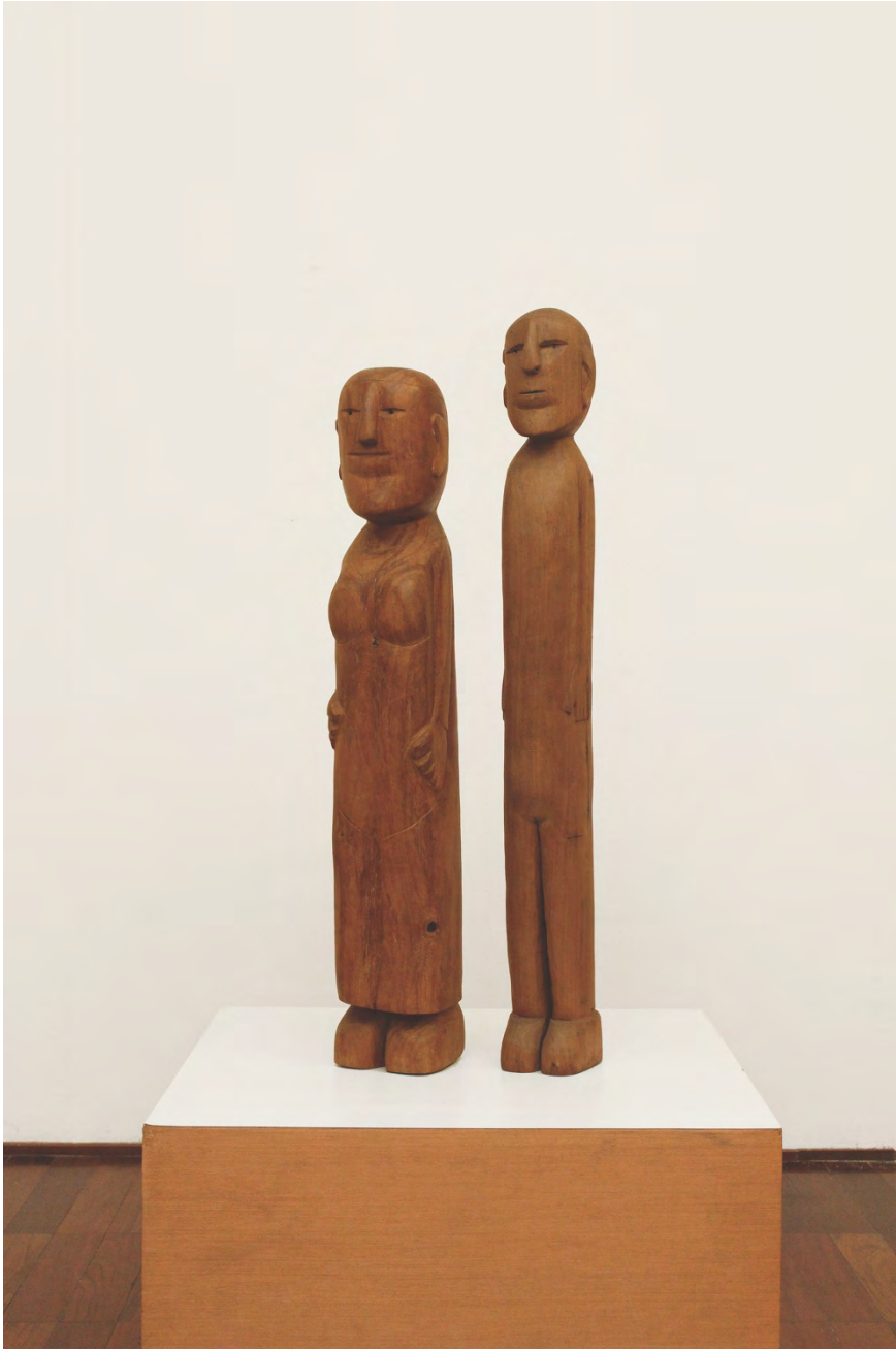
Untitled, Wooden sculpture 22 x 3 x 3 cm | 8.66 x 1.18 x 1.18 in