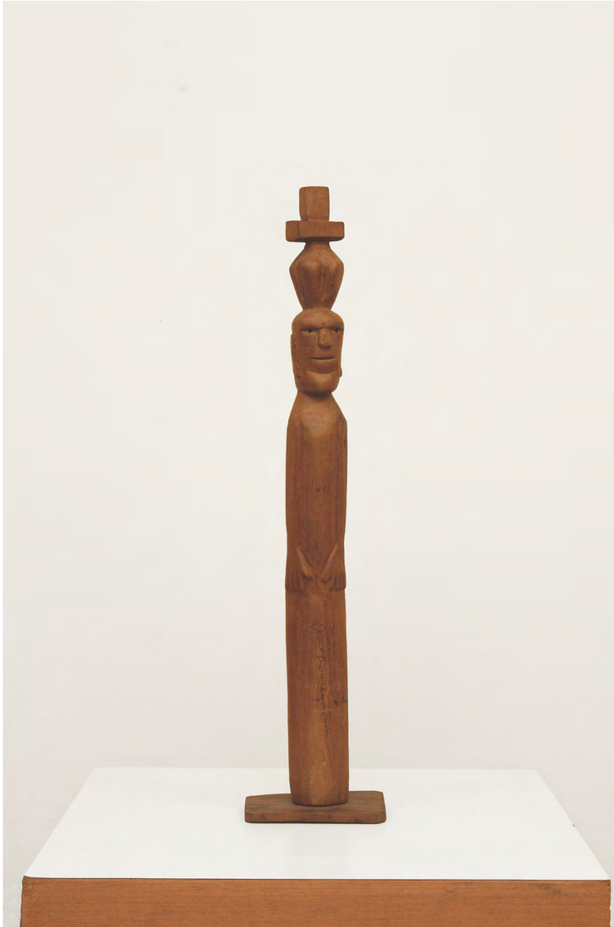
Untitled, 2008 Wooden sculpture 80 x 18 x 10 cm | 31.46 x 7.08 x 3.93 in