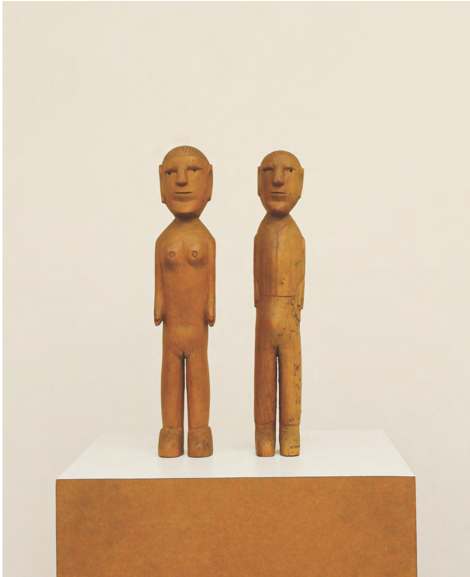
Untitled, Wooden sculpture 48 x 11 x 9 cm | 47 x 9 x 11 in