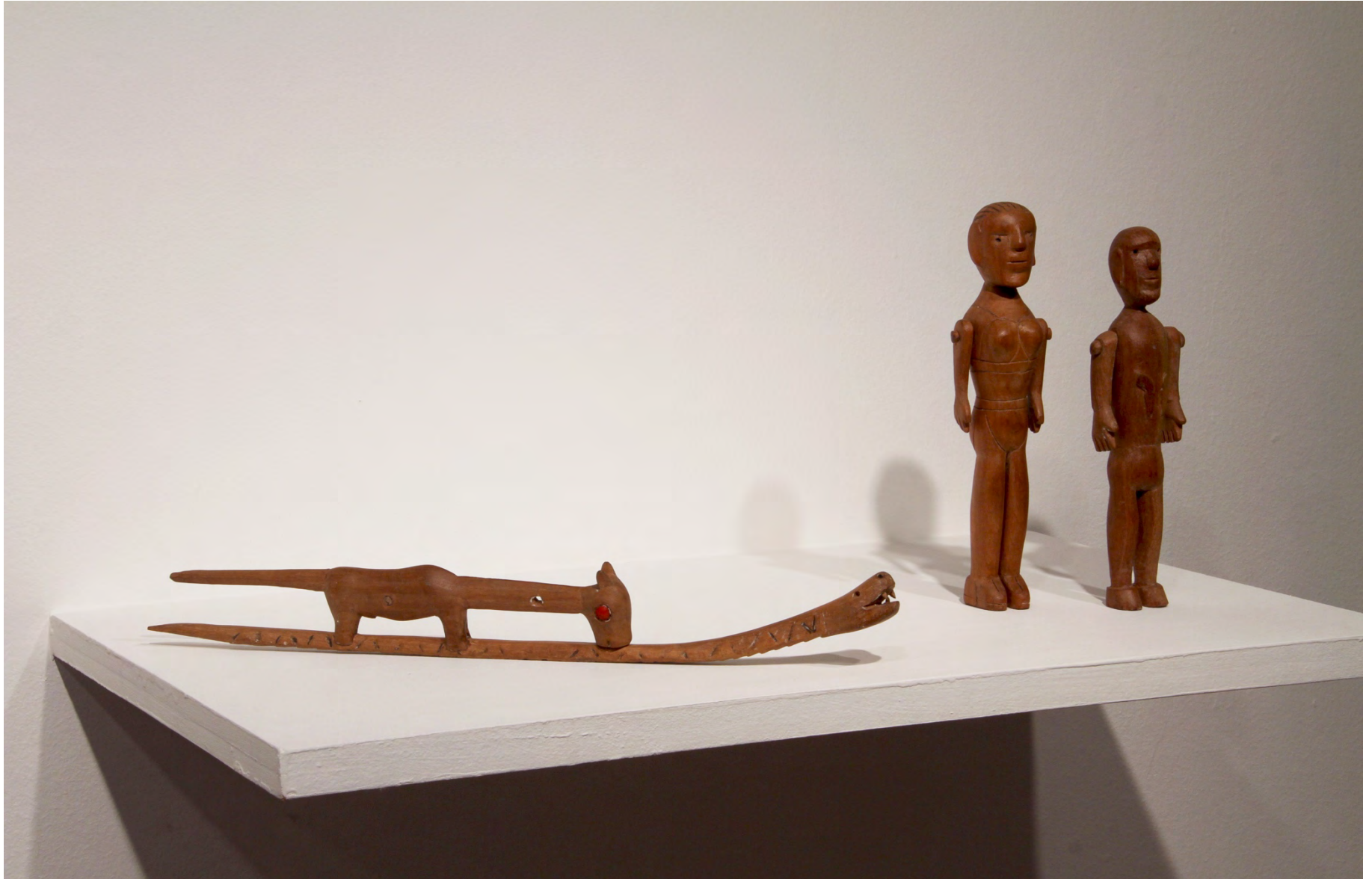
2014 Almost a figure, almost a shape, Galeria Estação, São Paulo, SP, Brazil