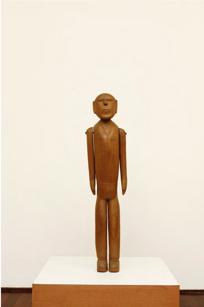
Untitled, 2008 Wooden sculpture 90 x 21 x 13 cm | 35.43 x 8.26 x 5.11 in