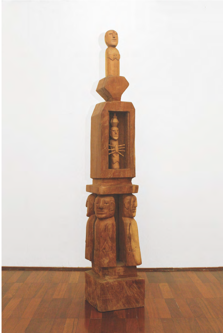
Untitled, Wooden sculpture 180 x 31 x 28 cm | 70.86 x 12.20 x 11.02 in