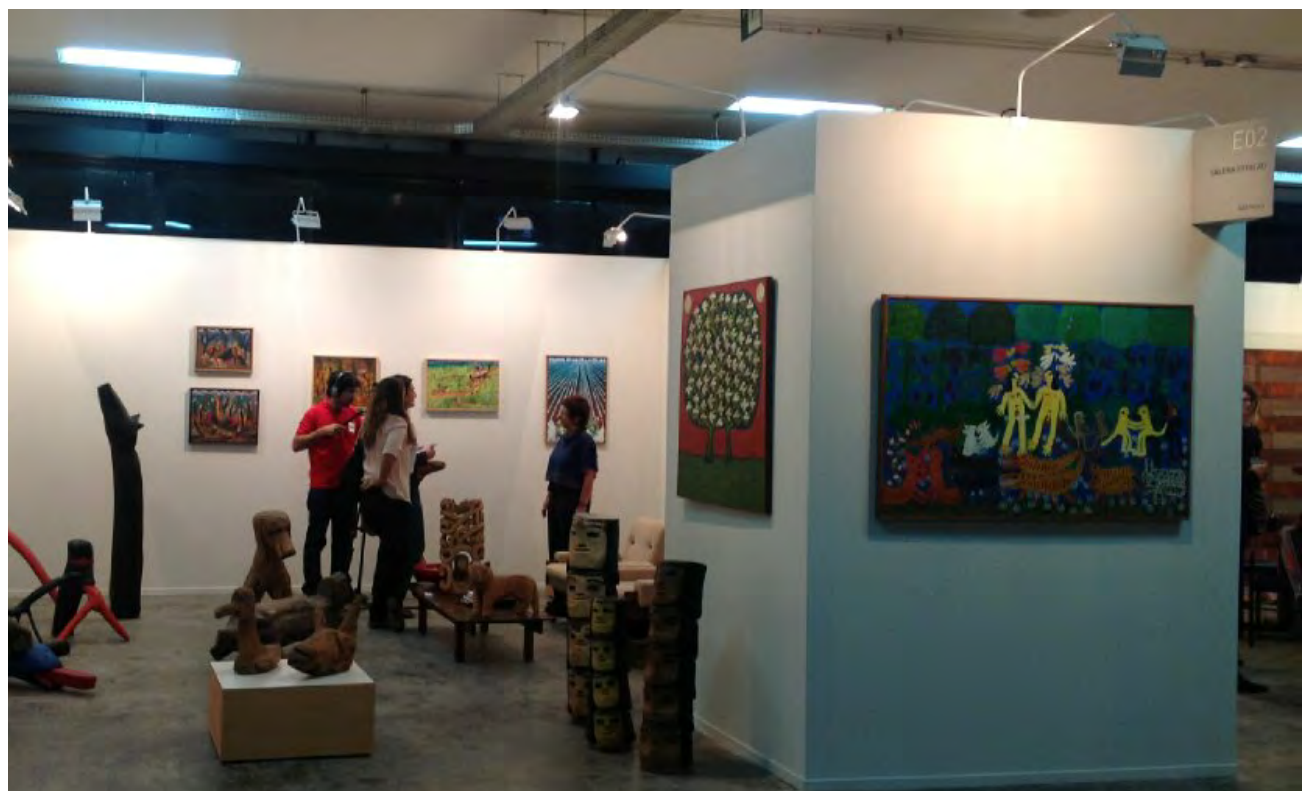
2013 SP-Arte, Pavilhão da Bienal - Parque do Ibirapuera , São Paulo, SP, Brazil