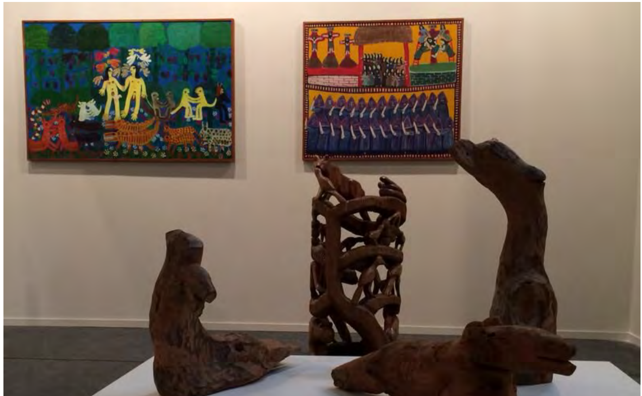
2014 SP-Arte Brasília, Iguatemi Brasília , Arena, Brasília, DF, Brazil