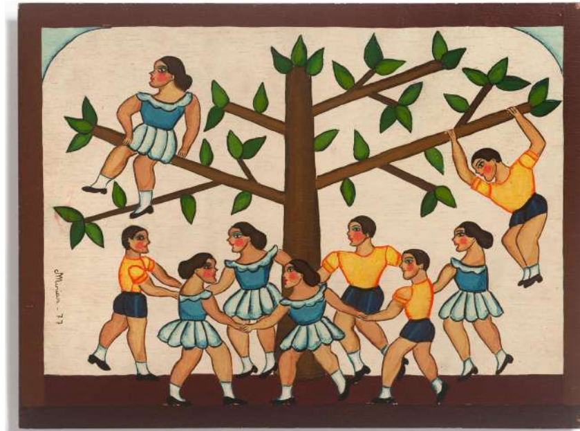
Mirian Inês da Silva Cerqueira 1938, Trindade - GO | 1996, Rio de Janeiro - RJ, Brazil

Untitled, 1980 Oil on plywood 29,5 x 39 cm | 11.41 x 15.35 in