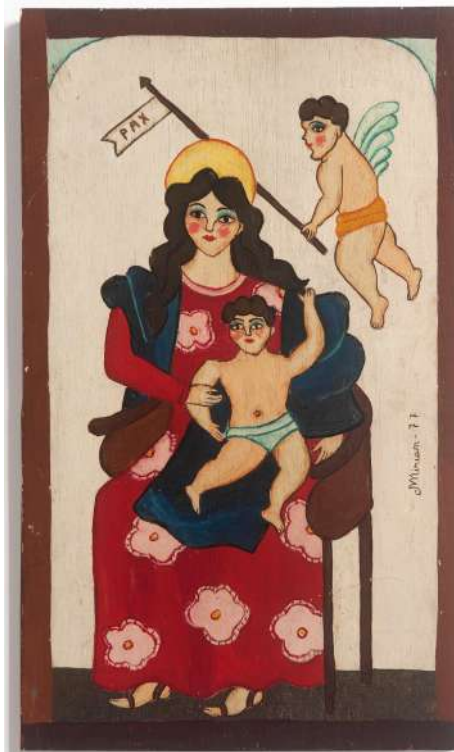
Mirian Inês da Silva Cerqueira 1938, Trindade - GO | 1996, Rio de Janeiro - RJ, Brazil

Untitled, 1977 Oil on wood 40 x 24 cm | 15.74 x 9.44 in