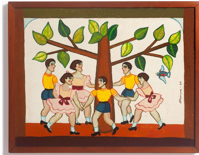
Mirian Inês da Silva Cerqueira 1938, Trindade - GO | 1996, Rio de Janeiro - RJ, Brazil

Untitled, 1977 Oil on wood 30 x 40 cm | 11.81 x 15.74 in