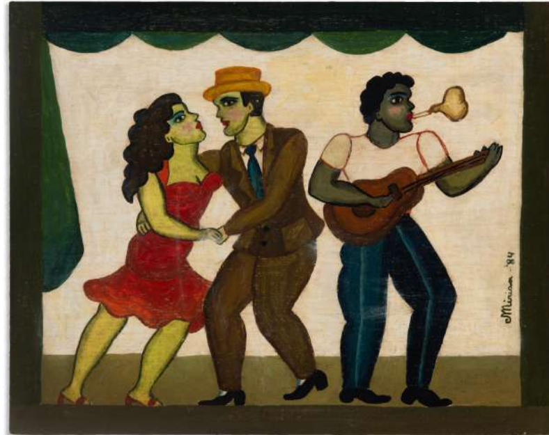
Mirian Inês da Silva Cerqueira 1938, Trindade - GO | 1996, Rio de Janeiro - RJ, Brazil

Untitled, 1984 Oil on wood 31.5 x 40 cm | 12.20 x 15.74 in