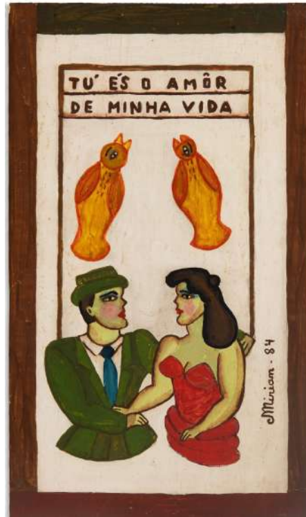
Mirian Inês da Silva Cerqueira 1938, Trindade - GO | 1996, Rio de Janeiro - RJ, Brazil

Untitled, 1984 Oil on wood 30 x 18 cm | 11.81 x 7.08 in