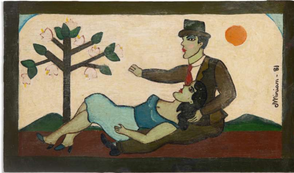
Miriam Inês da Silva Cerqueira 1938, Trindade - GO | 1996, Rio de Janeiro - RJ, Brazil

Untitled, 1981 Oil on wood 18 x 30 cm