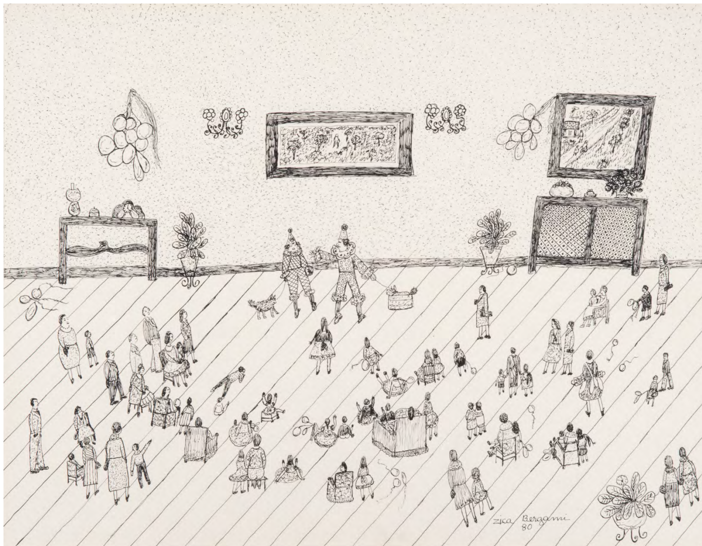
Party with clown, 1980 Ink on paper 48 x 58 cm | 18.89 x 22.83 in