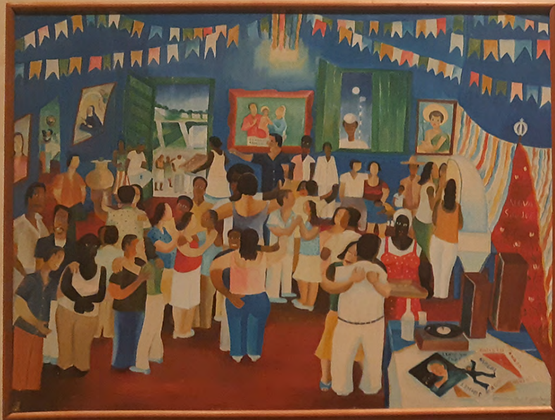
AMOR DE MULA 1964 Óleo sobre tela