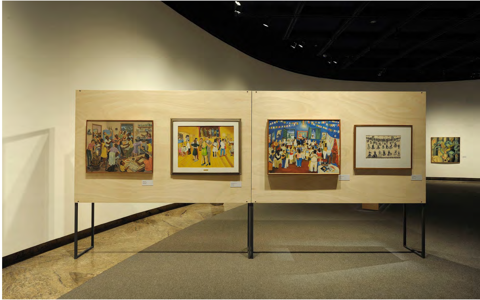
2021 Of Humanity: 100 Artists of the Collection, Museu de Arte Brasileira (MAB-FAAP, São Paulo, SP, Brazil)