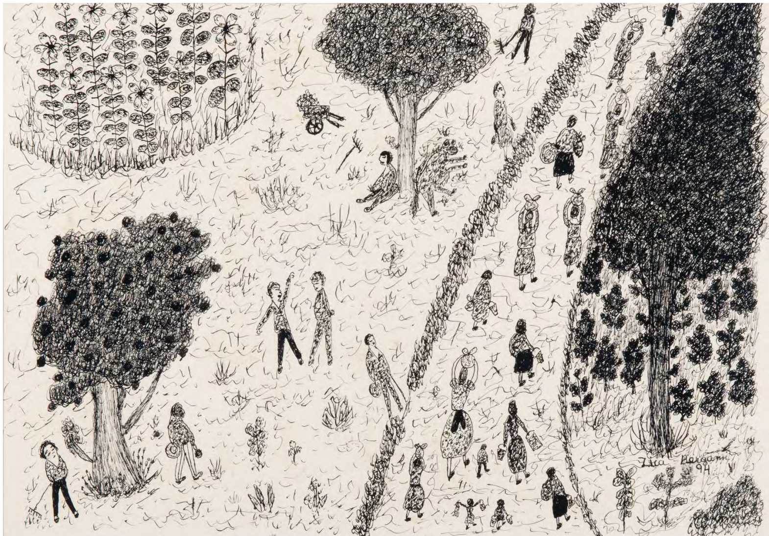
Untitled, 1994 Ink on paper 34 x 49 cm | 13.38 x 19.29 in