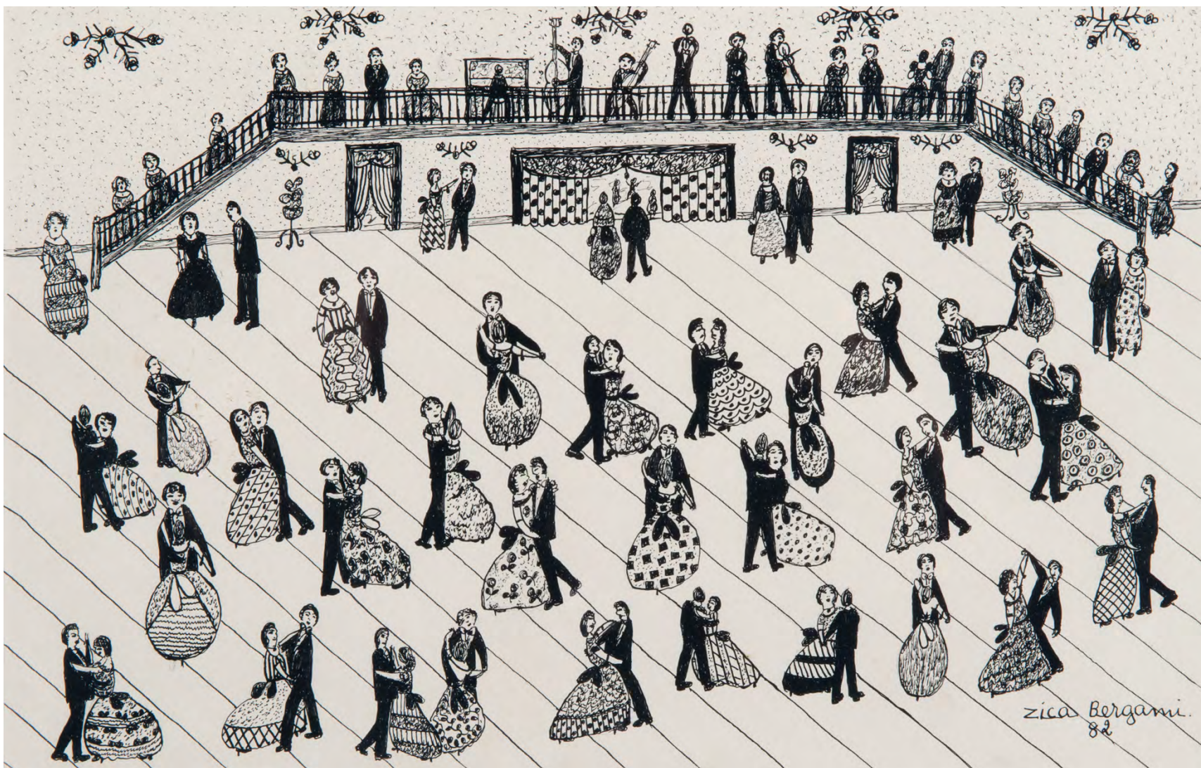
Ball, 1982 Ink on paper 24 x 37 cm | 9.44 x 14.56 in