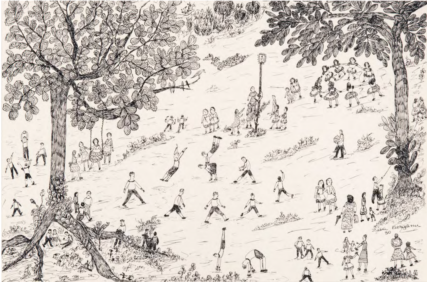
Merrymaking, 1980 Ink on paper 45 x 60 cm | 17.71 x 23.62 in