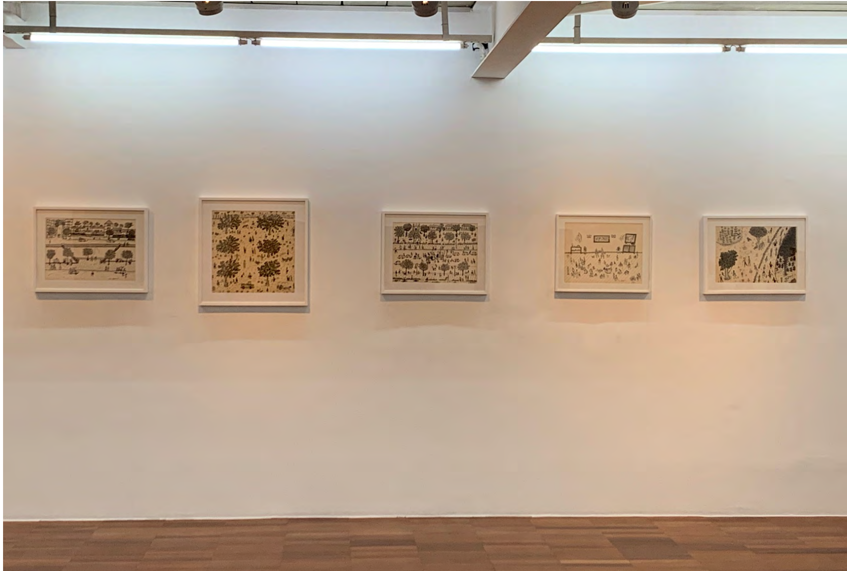
2020 Women in Popular Art, Galeria Estação, São Paulo, SP, Brazil