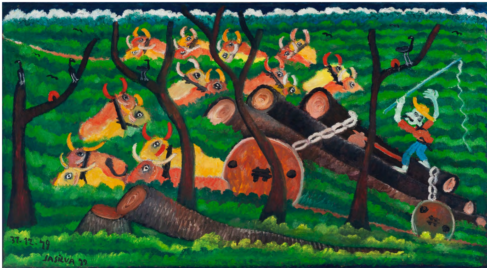
Untitled, 1979 Oil on canvas 53 x 97,5 cm | 20.86 x 38.18 in