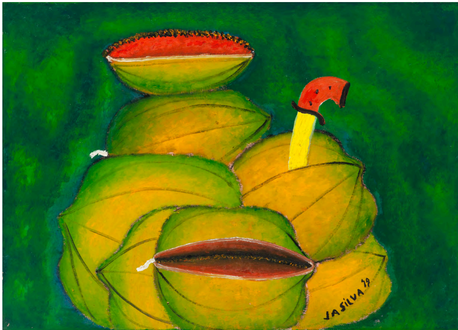
Untitled, 1979 Oil on canvas 50 x 70 cm | 19.68 x 27.55 in