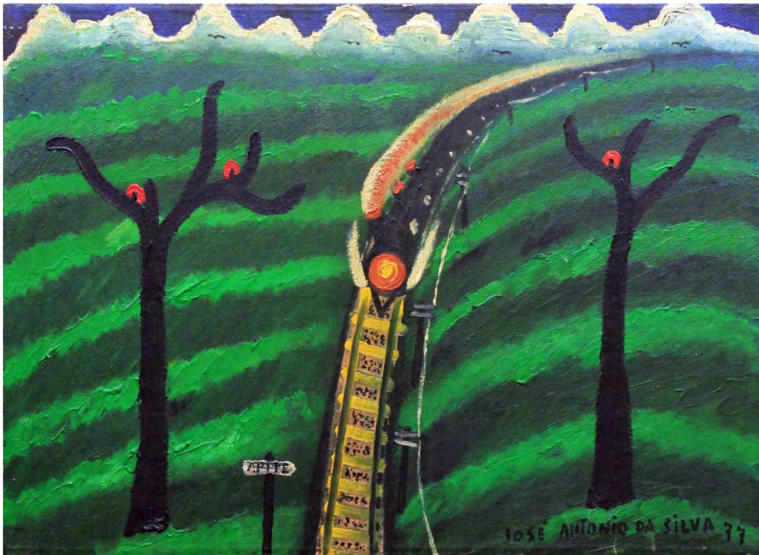
Train, 1977 Oil on canvas 50 x 70 cm | 19.68 x 27.55 in