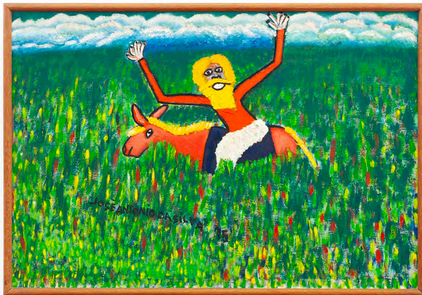
Untitled, 1975 Oil on canvas 50 x 80 cm | 19.68 x 31.49 in