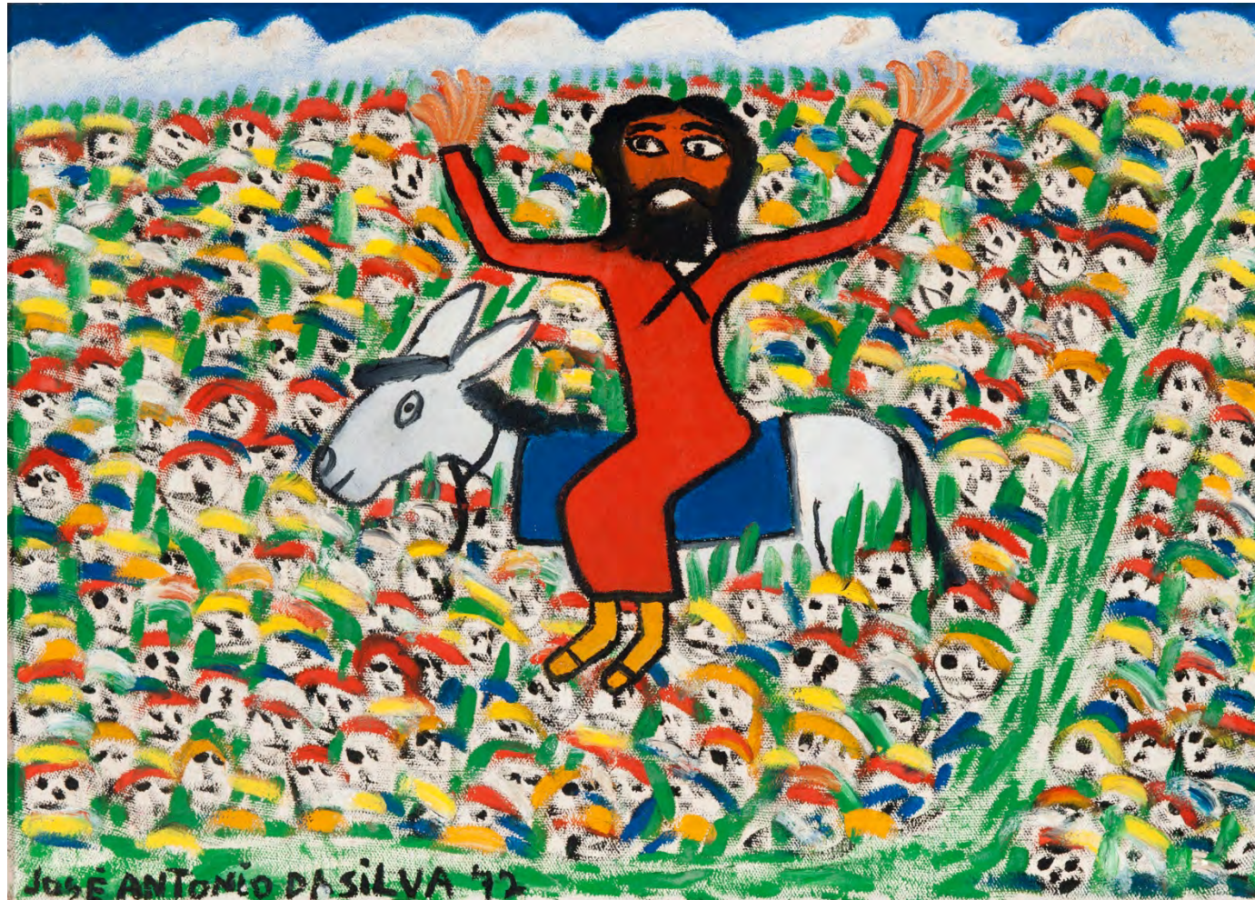
Triumphal entry into Jerusalem, 1972 Oil on canvas 44 x 62 cm | 17.32 x 24.40 in