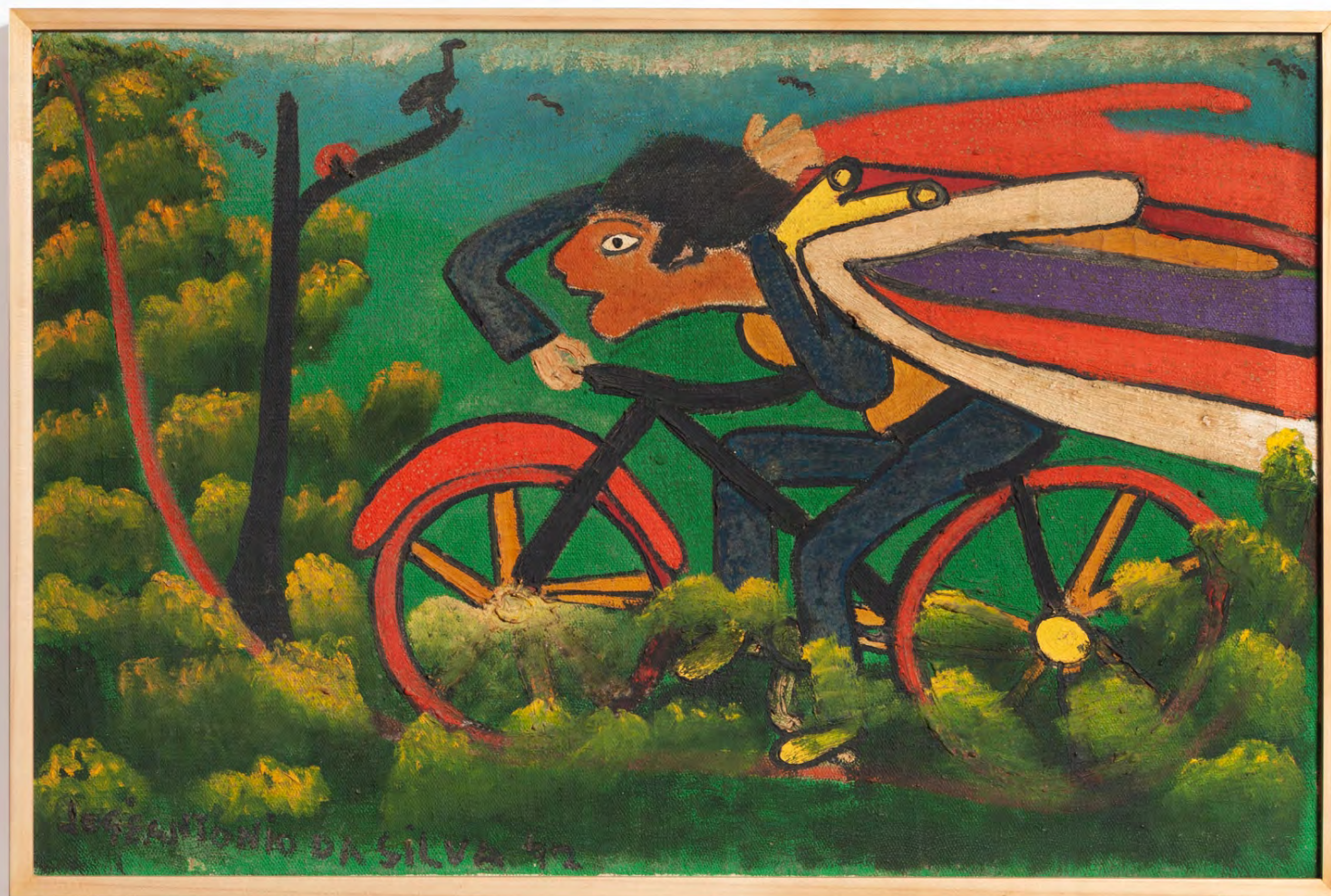
O tintureiro, 1972 Oil on canvas 41 x 62 cm | 16.14 x 24.40 in