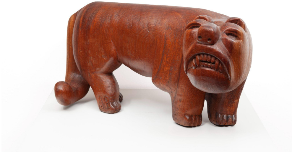
Artur Pereira 1920, Cachoeira do Brumado – MG | 2003, Mariana – MG, Brazil

Untitled, Déc 80 | 80's Wooden sculpture 31 x 55 x 36 cm | 12.20 x 21.65 x 14.17 in