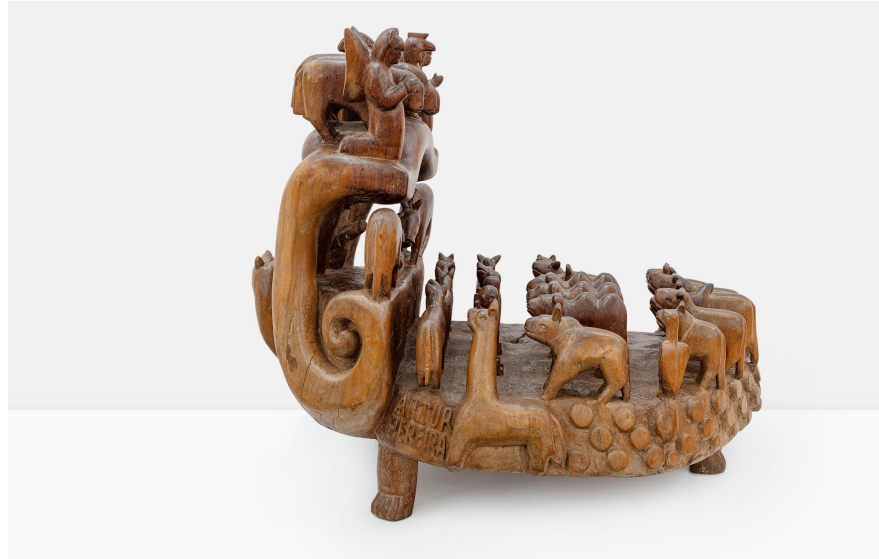
Artur Pereira 1920, Cachoeira do Brumado – MG | 2003, Mariana – MG, Brazil

Nativity scene, d'c. 80 | 80's Wooden sculpture 75 x 65 x 85 cm | 29.52 x 25.59 x 33.46 in