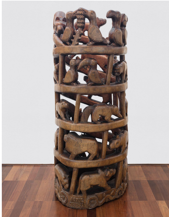
Artur Pereira 1920, Cachoeira do Brumado – MG | 2003, Mariana – MG, Brazil

Sem título, Déc 80 | 80's Wooden sculpture 138 x 64 x 73 cm | 54.33 x 25.19 x 28.74 in