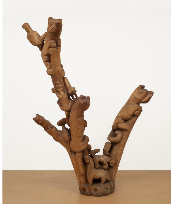
Artur Pereira 1920, Cachoeira do Brumado – MG | 2003, Mariana – MG, Brazil

Galhada, Déc 80 | 80's Wooden sculpture 174 x 132 x 83 cm | 57.87 x 51.96 x 32.67 in