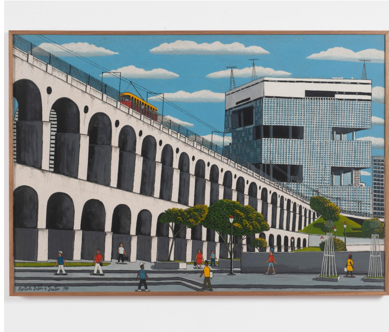
Agostinho Batista de Freitas 1927, Campinas - SP | 1997, São Paulo - SP

Lapa Arches, 1991 Oil on canvas 70 x 99 cm | 27.55 x 38.97 in