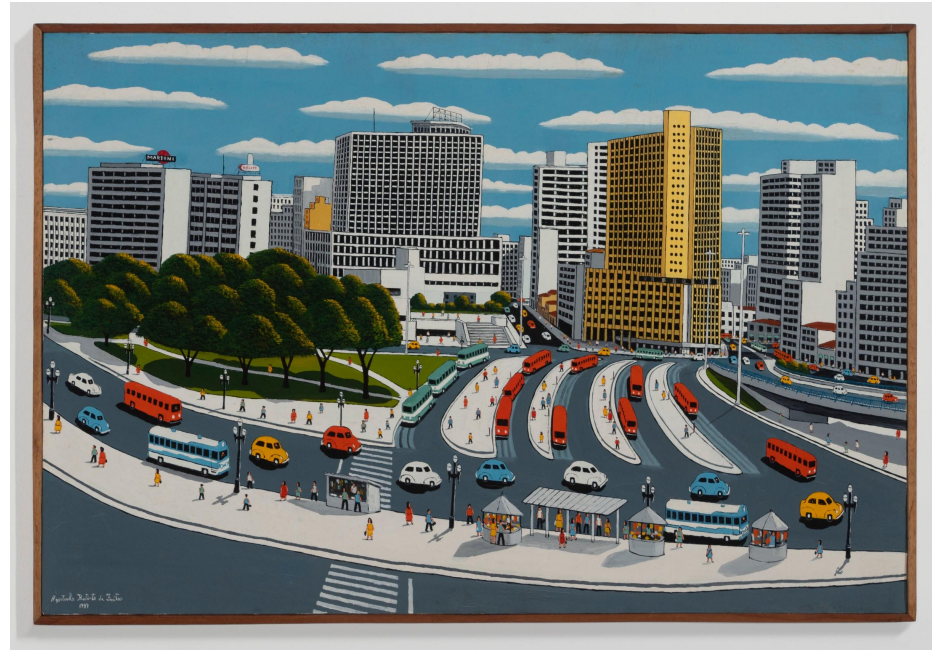
Agostinho Batista de Freitas 1927, Campinas - SP | 1997, São Paulo - SP

Praça da Bandeira, 1989 Oil on canvas 80 x 120 cm | 31.49 x 47.24 in