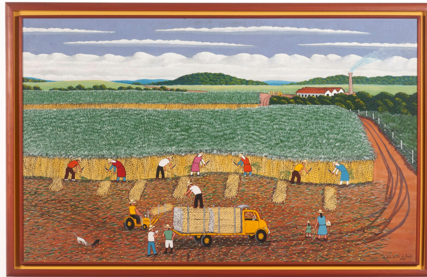
Agostinho Batista de Freitas 1927, Campinas - SP | 1997, São Paulo - SP