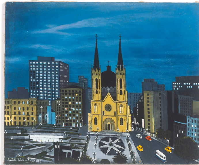
Agostinho Batista de Freitas 1927, Campinas - SP | 1997, São Paulo - SP