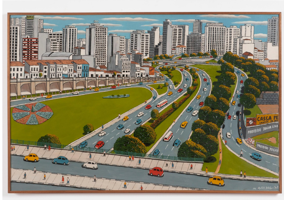
Agostinho Batista de Freitas 1927, Campinas - SP | 1997, São Paulo - SP