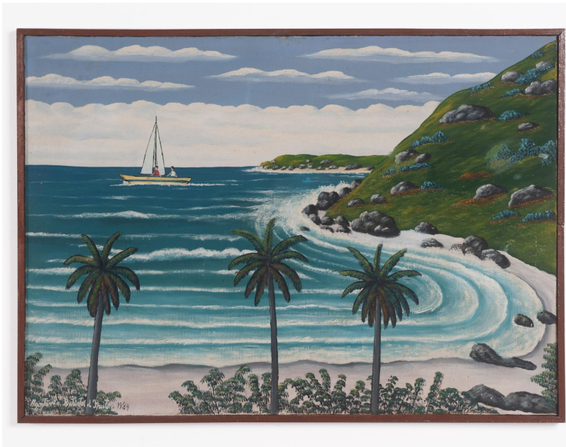
Agostinho Batista de Freitas 1927, Campinas - SP | 1997, São Paulo - SP