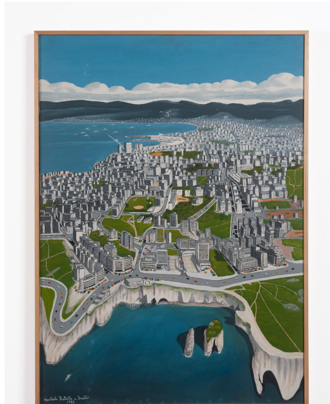
Agostinho Batista de Freitas 1927, Campinas - SP | 1997, São Paulo - SP

Pigeon Rocks - Beirute, 1983 Oil on canvas 100 x 70 cm | 39.37 x 27.55 in