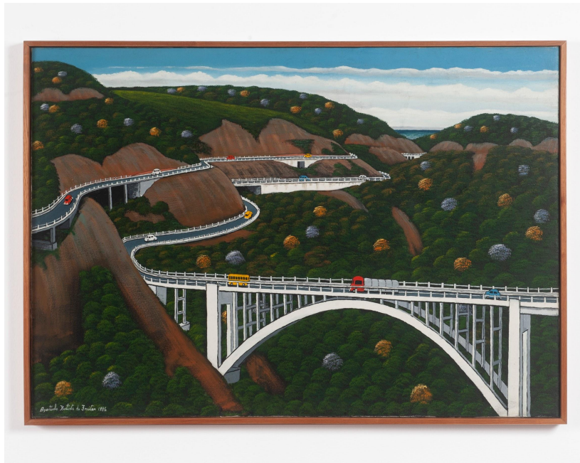
Agostinho Batista de Freitas 1927, Campinas - SP | 1997, São Paulo - SP