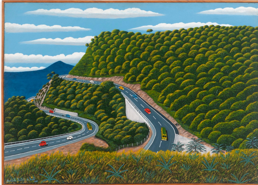
Agostinho Batista de Freitas 1927, Campinas - SP | 1997, São Paulo - SP