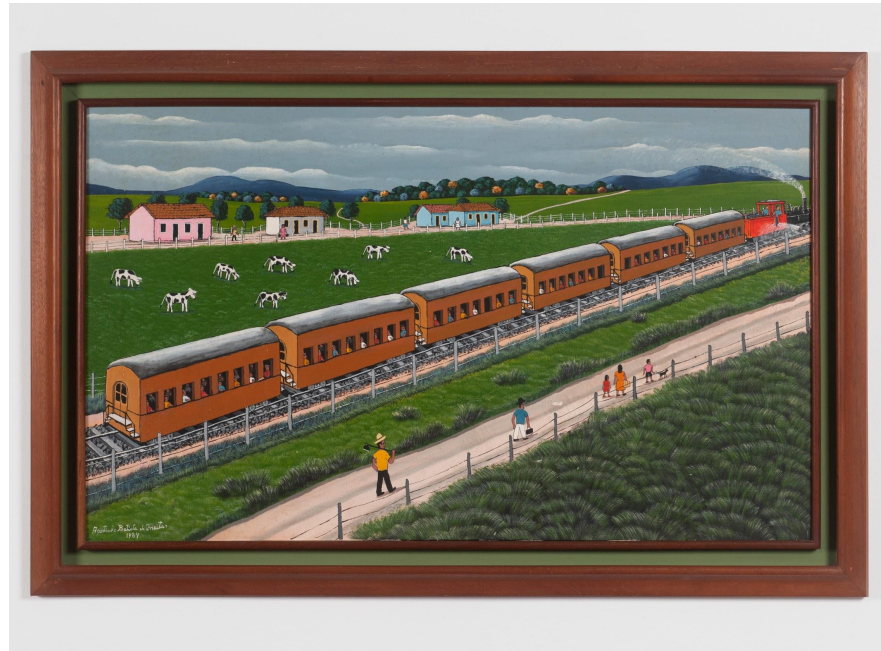
Agostinho Batista de Freitas 1927, Campinas - SP | 1997, São Paulo - SP